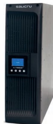
► SLC TWIN RT