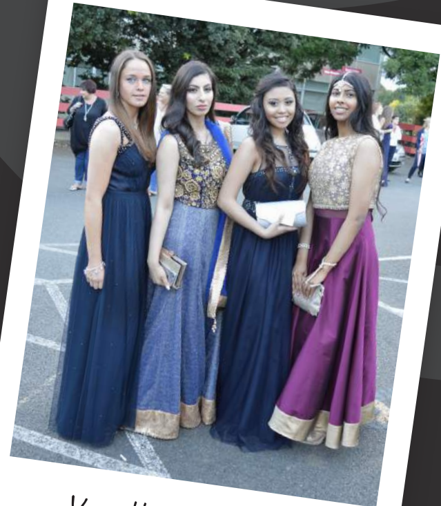
Year 11 Prom 2016

“ Being at Southfield for 5 years has helped me to grow as a person. All of the teachers have pushed me to my highest ability, but in the process supported me through everything.