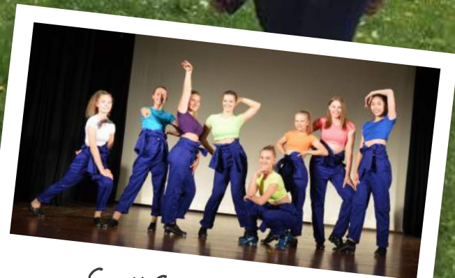
SouthStep dance tour