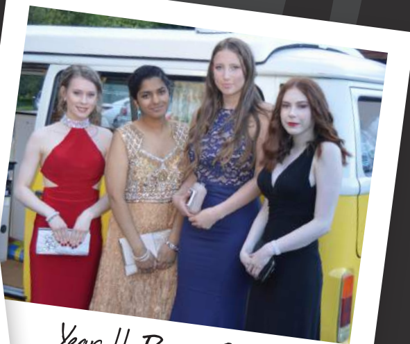
Year 11 Prom 2016