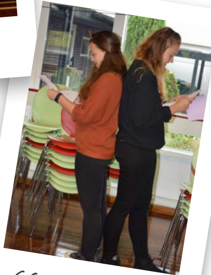
GCSE Results Day