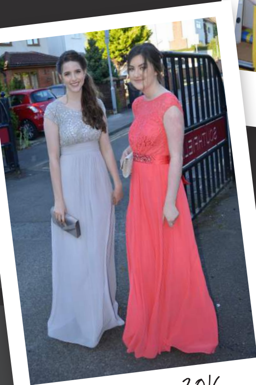
Year 11 Prom 2016