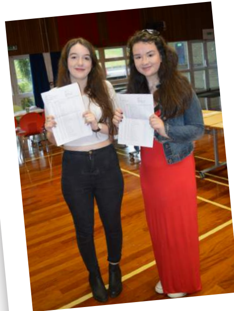
GCSE Results Day