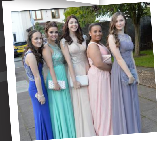
Year 11 Prom 2016