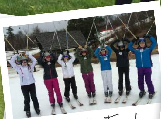
Annual Ski Trips!