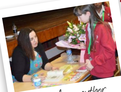
Visit from author Cathy Cassidy

“We always enjoy the tea dances and the girls who have come to visit our home have been a real credit to you! Thank you.”