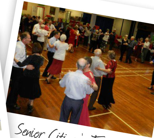
Senior Citizen's Tea Dance