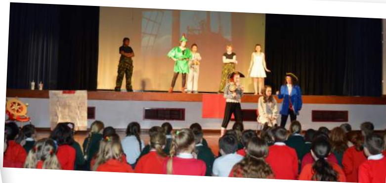
Local primary school visitors