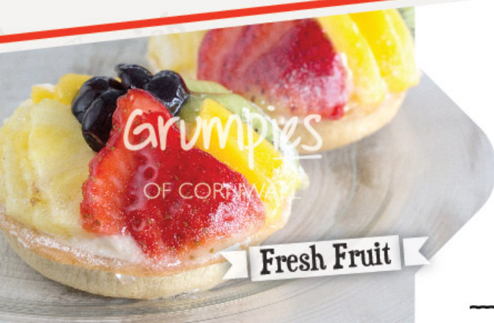
Grumpies OF CORNWALL