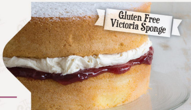
Gluten Free Victoria Sponge