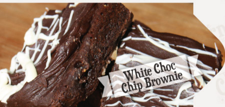
White Choc Chip Brownie