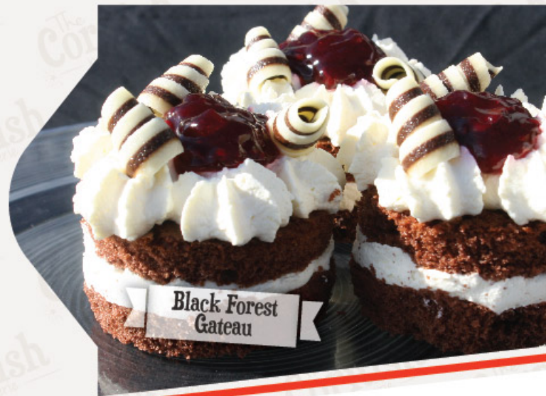
Black Forest Gateau