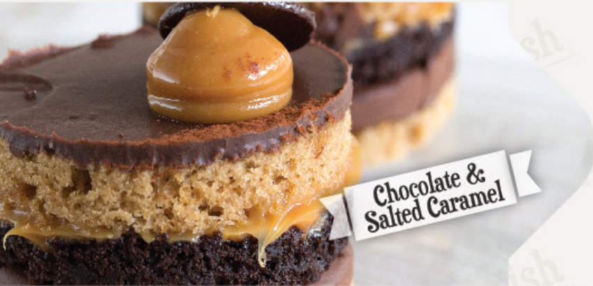
Chocolate & Salted Caramel