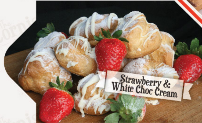
Strawberry & White Choc Cream