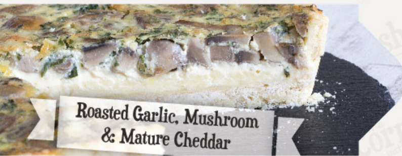
Roasted Garlic, Mushroom & Mature Cheddar