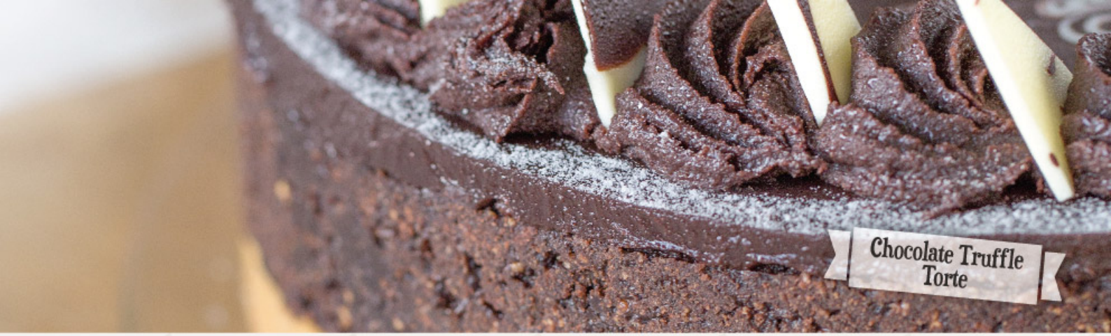
Chocolate Truffle Torte

Hand-made to order to save you time and space in your kitchen.