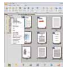
The PaperPort SE14 main screen

- The Professional Choice to Organize and Share Your Documents