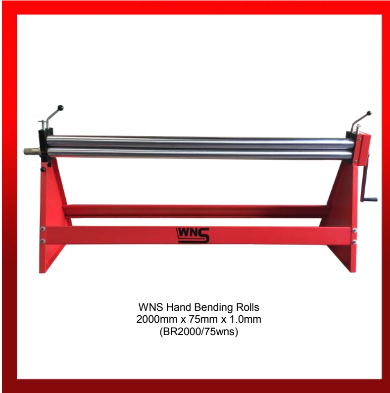
WNS Hand Bending Rolls 2000mm x 75mm x 1.0mm (BR2000/75wns)

W. NEAL SERVICES LTD 29 Purdeys Way Purdeys Industrial Estate Rochford Essex SS4 1ND ENGLAND