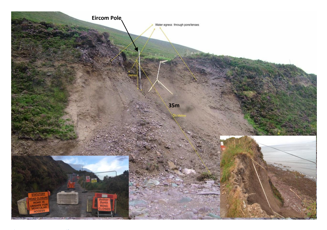
Figure 2 – 2015 Failure