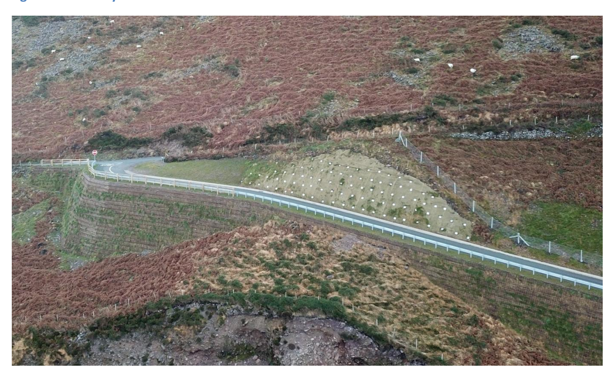
Figure 6 - Soil nailing at cut section below existing road