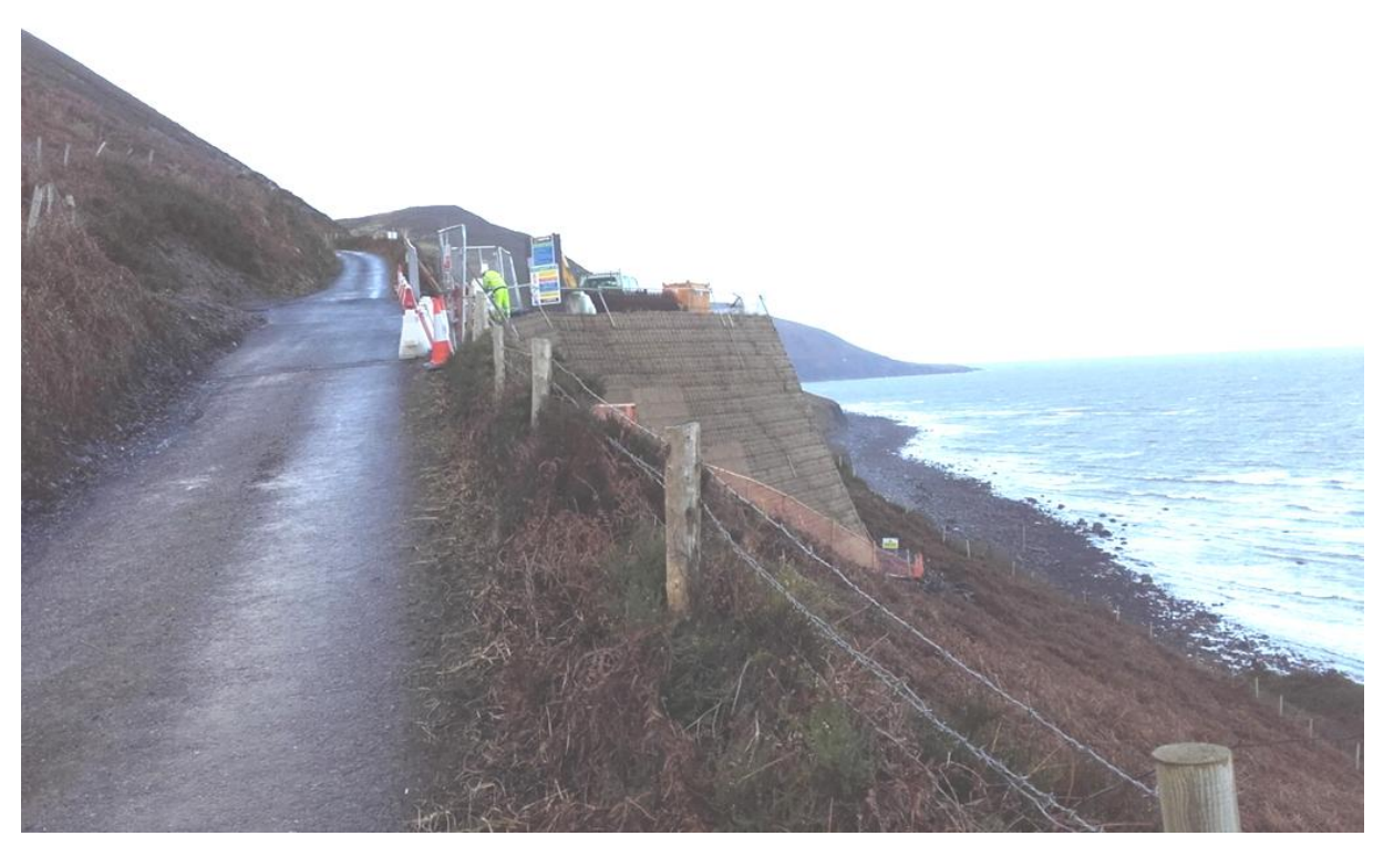
Figure 8 - High embankment facing west