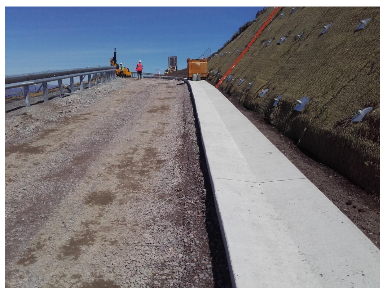
Figure 9 - Drainage channel