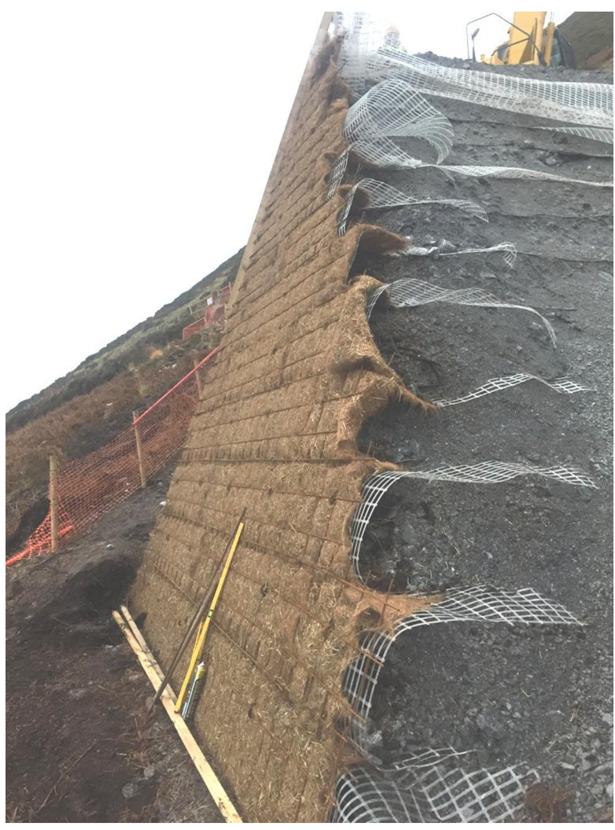
Figure 7 - Embankment under construction