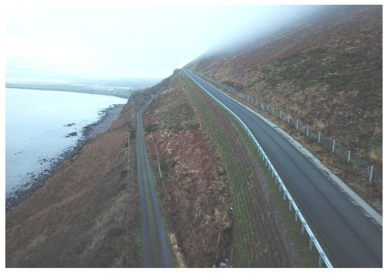
Figure 10 - Completed road facing east