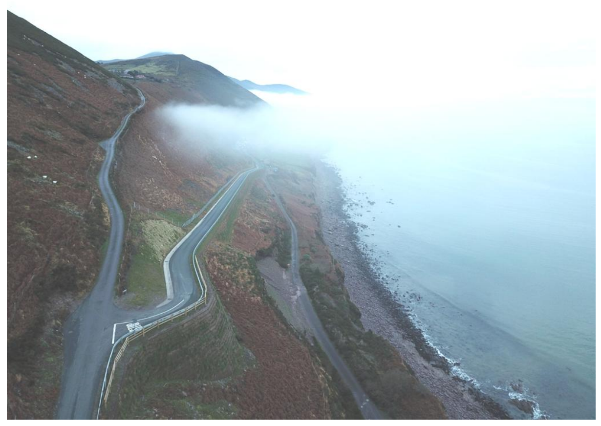
Figure 11 - Completed road facing west