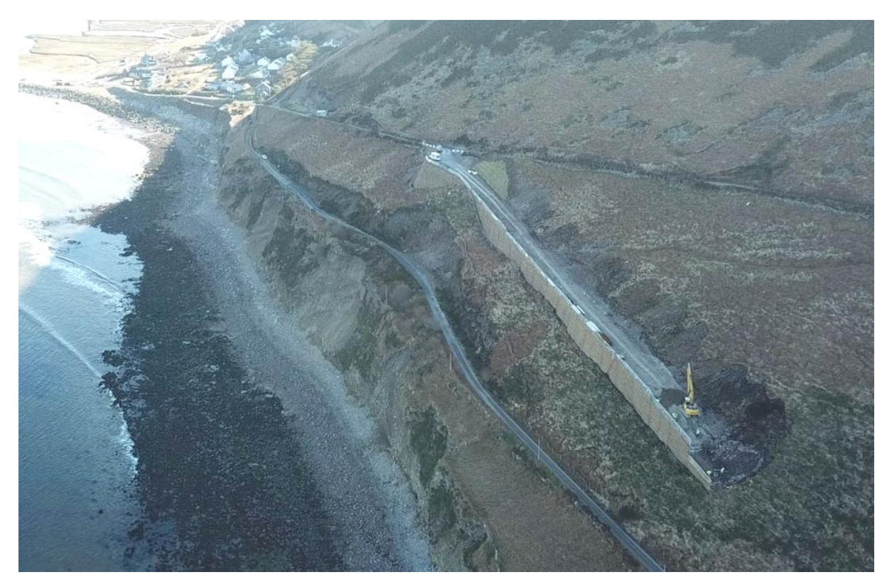
Figure 5 - Partially constructed road