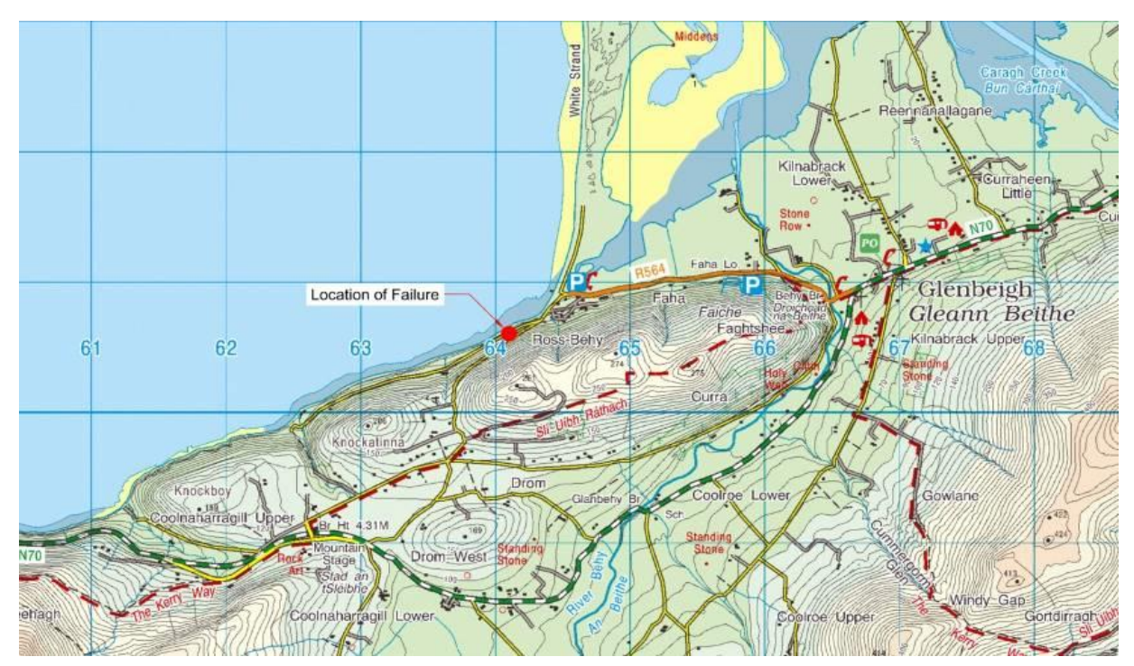
Figure 1 - Location of Cliff Road bypass