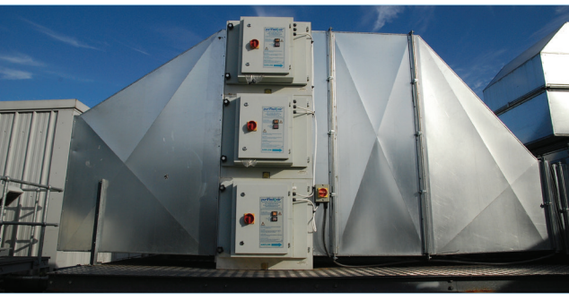
3 ESP Units Stacked in modular formation