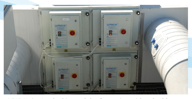
4\ \mbox{ESP} Units Stacked in modular formation with a double pass