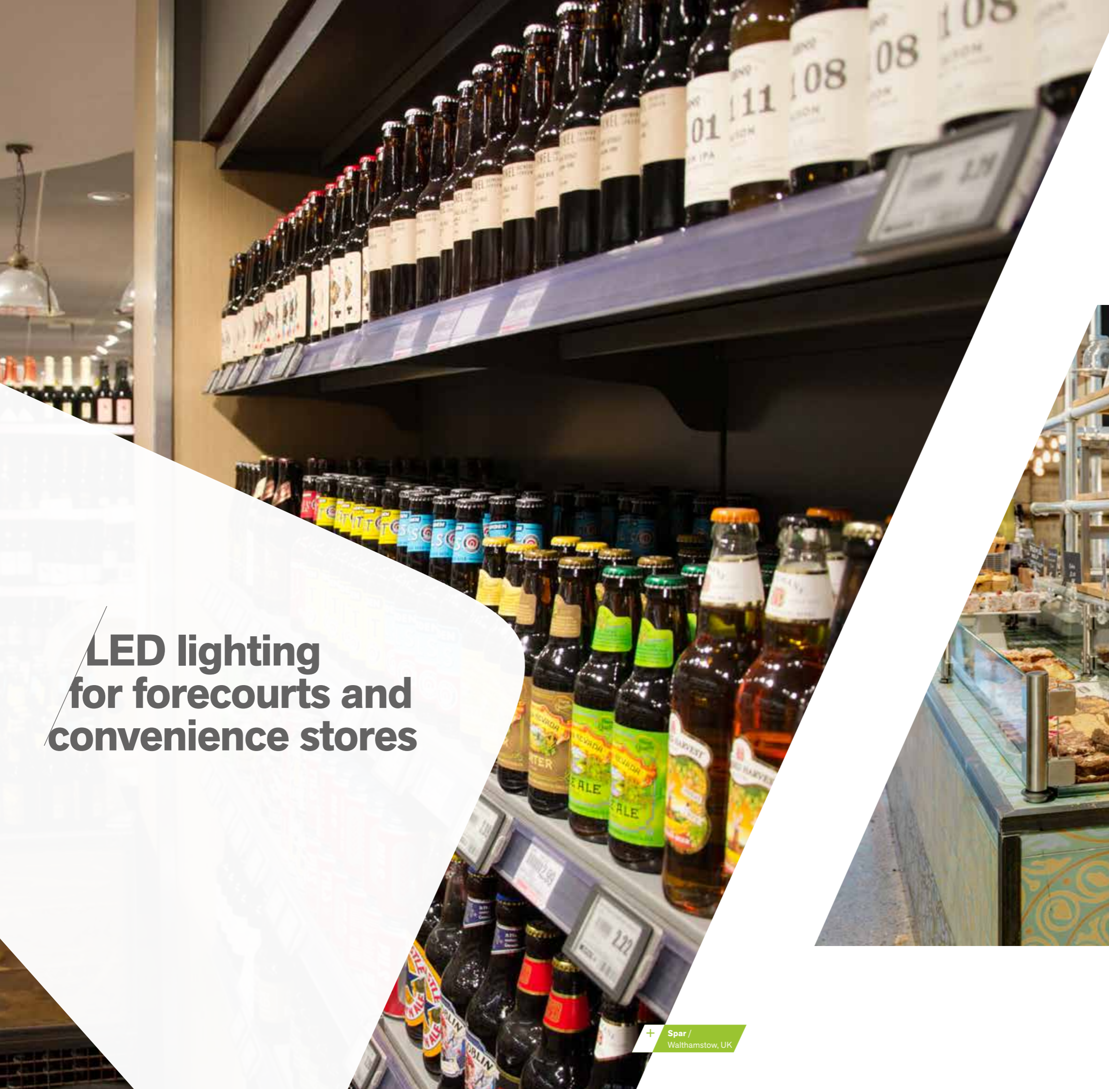
+ Spar / Walthamstow, UK