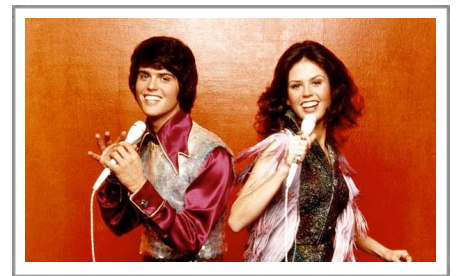
Donny & Marie