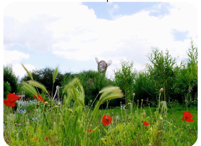
The Sensory Garden viewed through wild flowers. PR