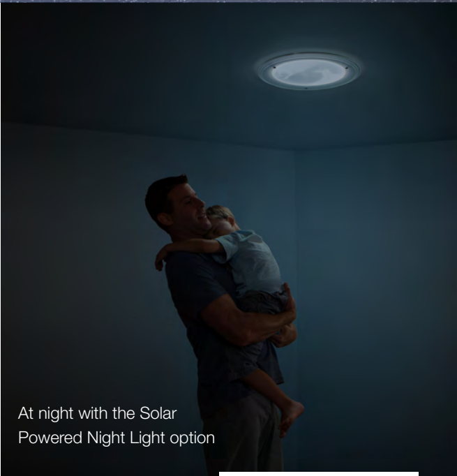
At night with the Solar Powered Night Light option