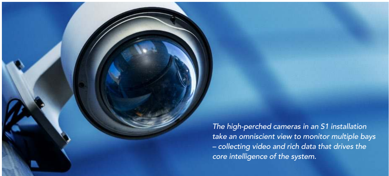
The high-perched cameras in an S1 installation take an omniscient view to monitor multiple bays – collecting video and rich data that drives the core intelligence of the system.

When parkers arrive at your facility, they're typically stressed and in a hurry.