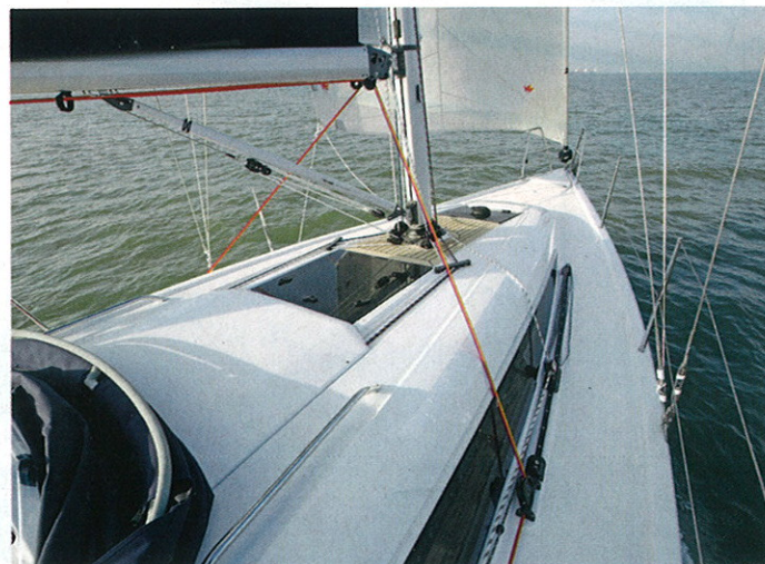
The mainsheet may be a trip hazard for crew standing on the cabin top

The interior is generally good, with the same high-quality joinery and fittings as the Dehler 38, 42 and 46. She's got the lovely wood-rich roll-top lockers, the large table (straight from the 42) with its four-bottle drawer inside. She also has the same bicolour reading lights, touch-panel lighting switch and LED striplights set in panels in the headlining, outboard of the