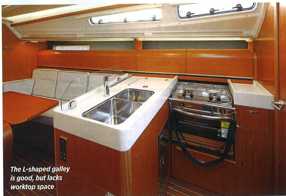
The L-shaped galley is good, but lacks worktop space

The fuses are behind a panel under the chart table. Access to the engine is via the companionway steps and inspection hatches on both sides. The raw water strainer is tucked away at the back, and access to the engine's impeller is restricted by a screwed-in panel – I'd prefer a simple slot in the panel, like a washboard. All other service points are easy to tend.