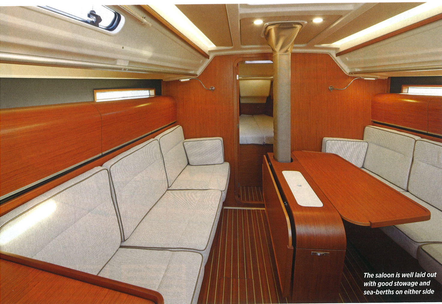
The saloon is well laid out with good stowage and sea-berths on either side

double mattress for two singles and fit a leecloth between them.