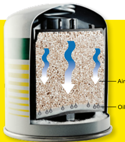
Air dryer cartridge with coalescence filter – cross-sectional model

MANN-FILTER air dryer cartridges contain an extremely high quality drying agent demonstrating high water resistance and mechanical stability.