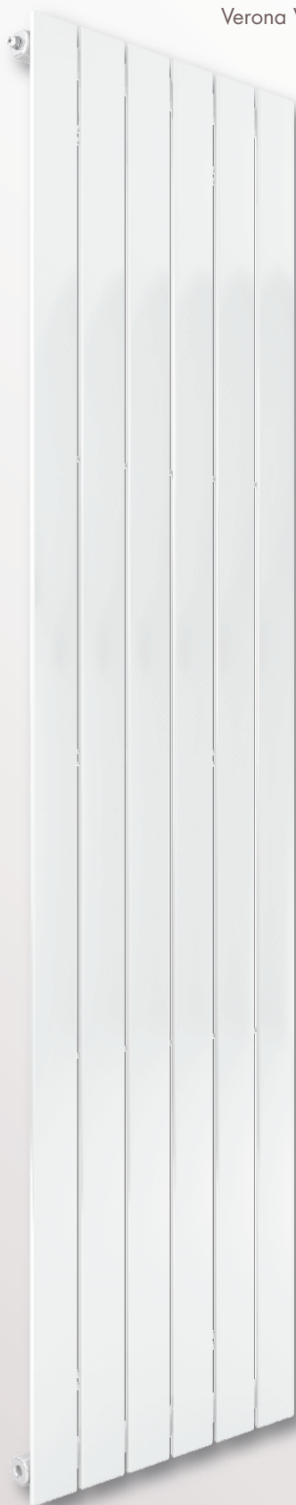
Verona Vertical Single