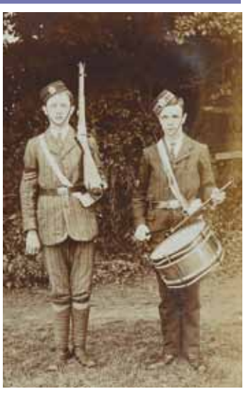
Some of the images from the Church Lads' Brigade album; you can see more photos on the museum website