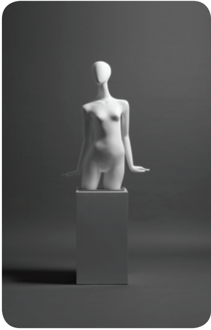
JG1 FLAT BASE