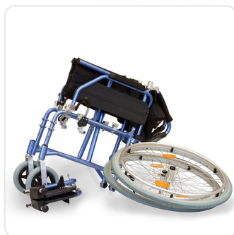
Dismantle for transport.