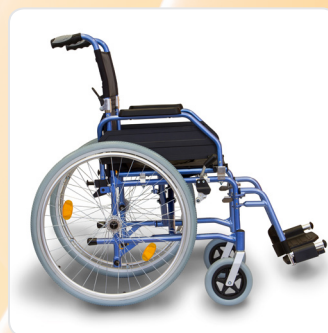
Swing away detachable leg rest.