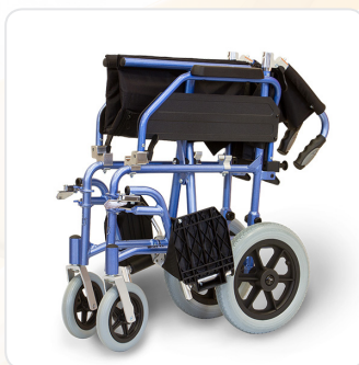
Easy fold away.