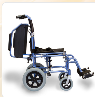
Flip back armrest.