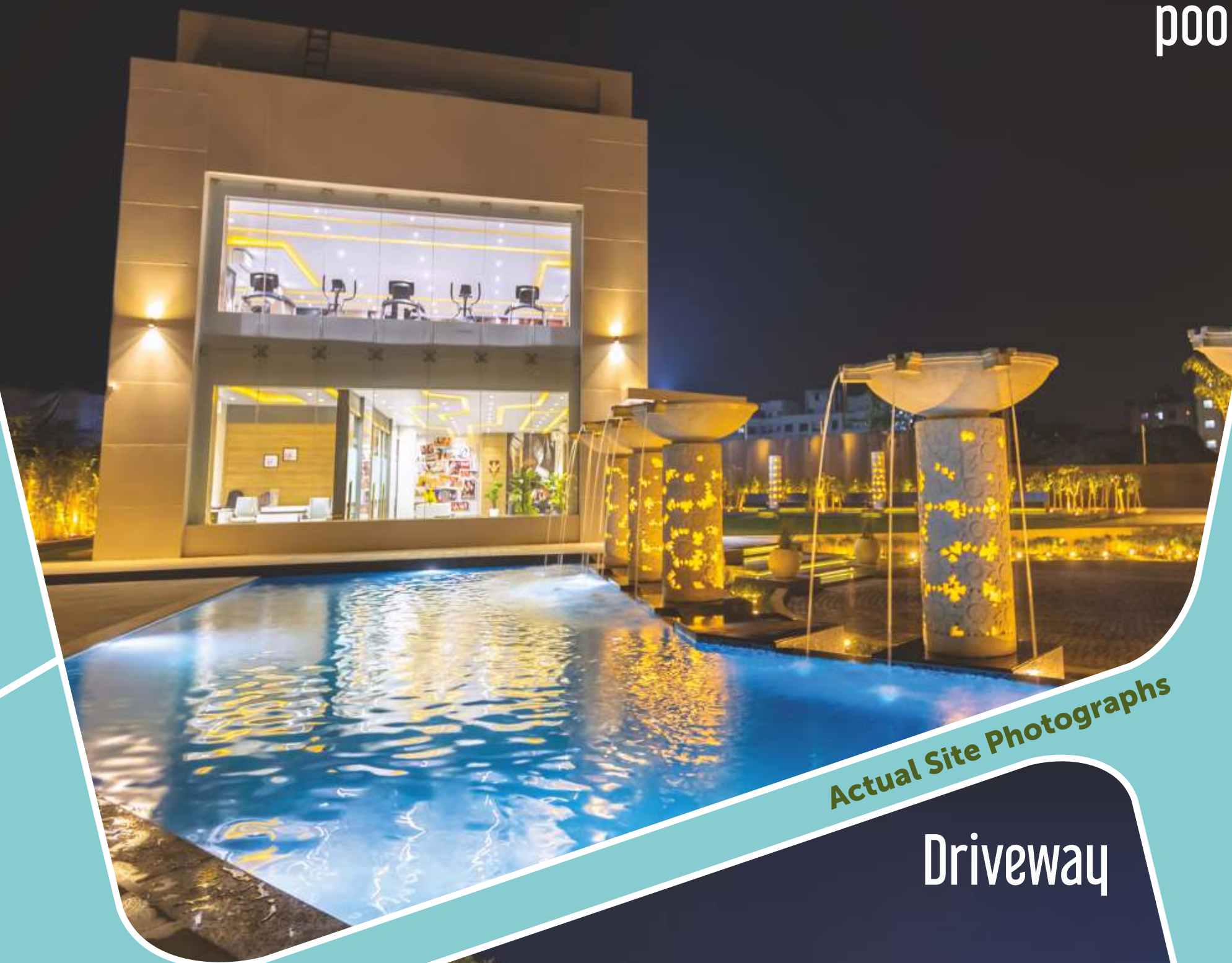
Actual Site Photographs