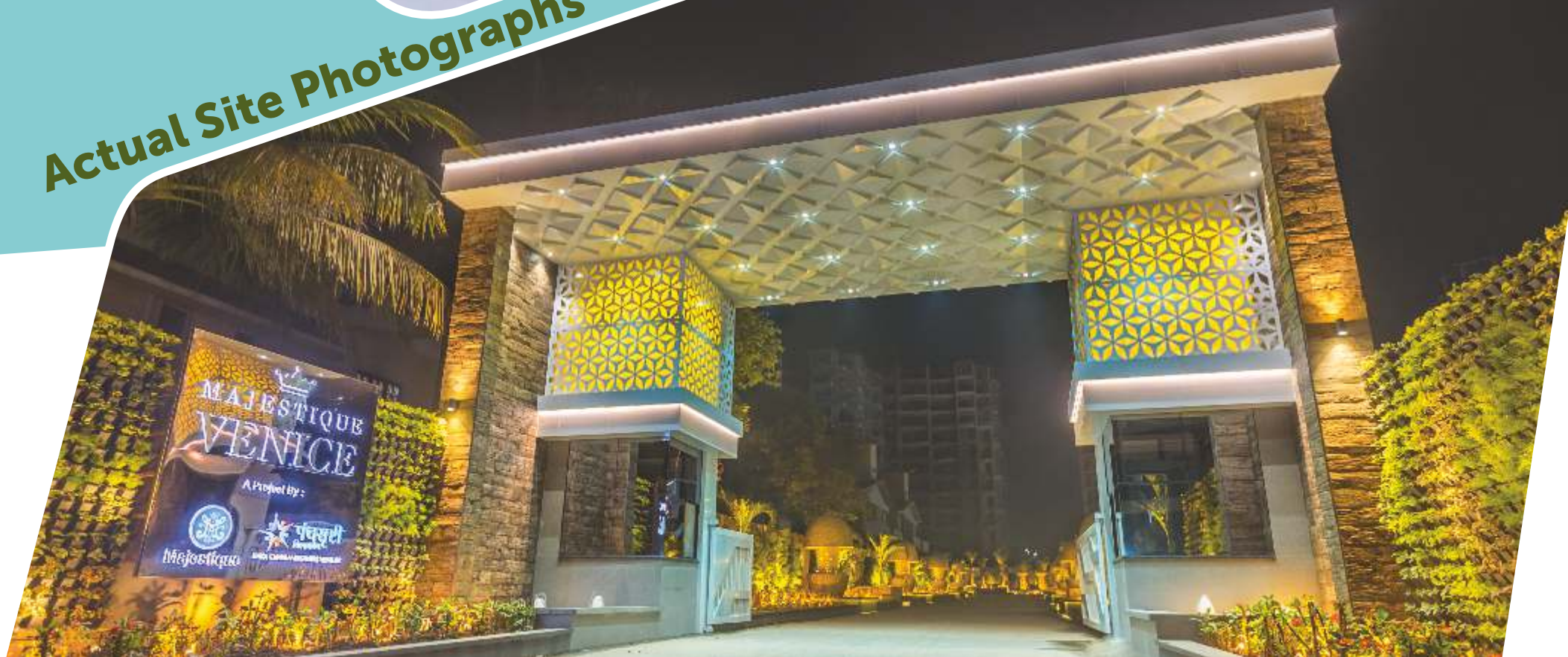
Actual Site Photographs