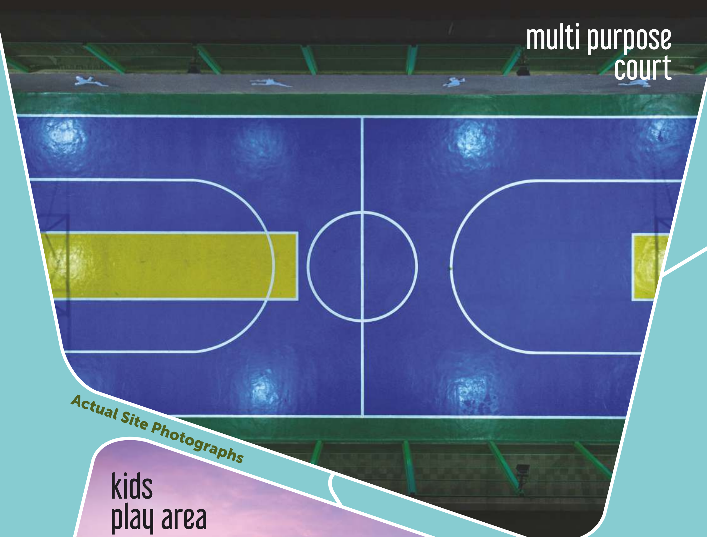
Actual Site Photographs