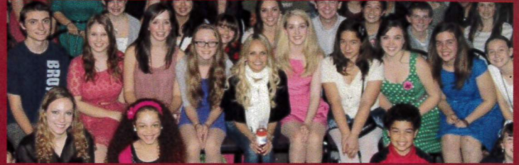
Kristin Chenoweth teaches on STC Cabaret Stage