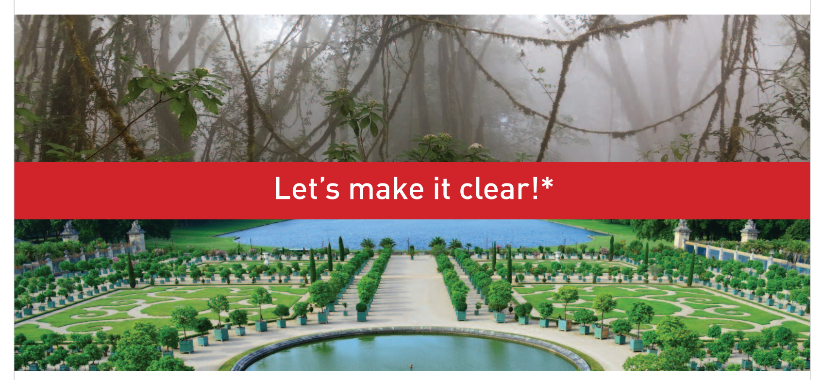
*You thought that employment law in France was a jungle, let's make it clear!