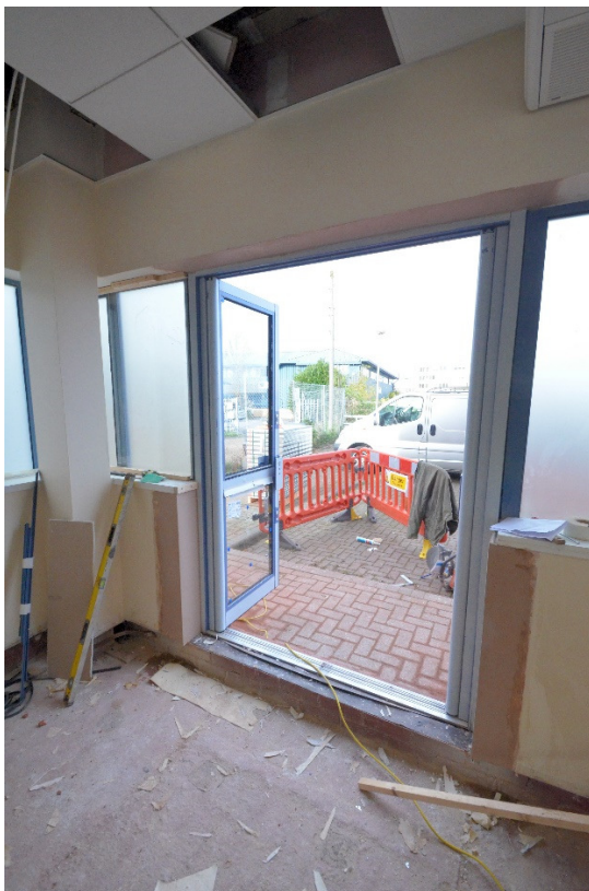
New external door