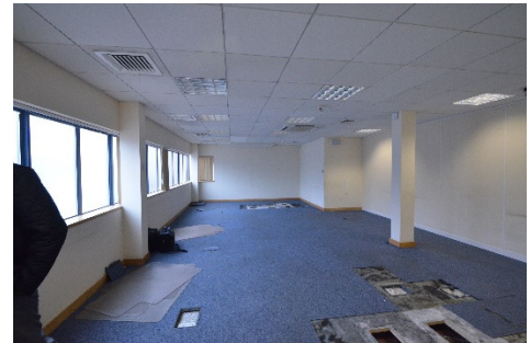
The existing space prior to conversion and remodelling