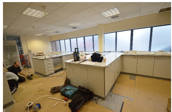
Installation nearing completion