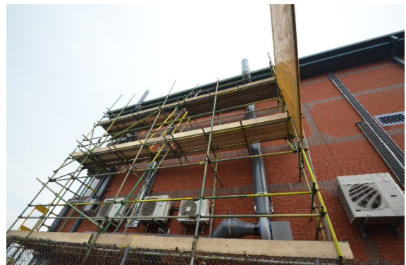
New fume extract systems