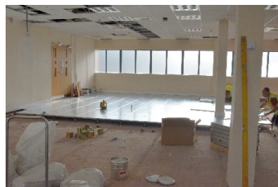
Installation of new heavy duty raised access floor