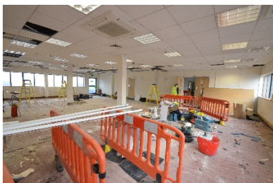
Existing partitions and raised floor stripped out