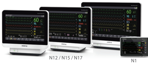
N12 / N15 / N17