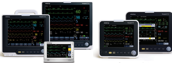
Passport 12m / 17m T1