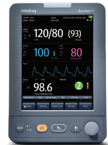
Accutorn 3 / 7

On any given day, 1 in 25 hospital patients is being treated for a healthcare-associated infection (CDC – HAI Data and Statistics)*. These incidences are a major threat to patient safety and are often preventable via standardized cleaning and disinfection protocols.