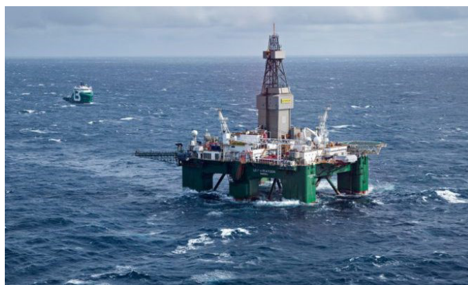
Semi-submersible rig Leiv Eiriksson

Anchor handling vessel, Skandi Iceman, was mobilised with dual GNSS receivers, navigational software, ROV positioning hardware and two experienced surveyors for the pre-lay of the anchors. After the anchors were landed, fixes of their as-laid positions and ROV pick-up buoys were taken and used to produce an as-laid chart in ArcGIS.