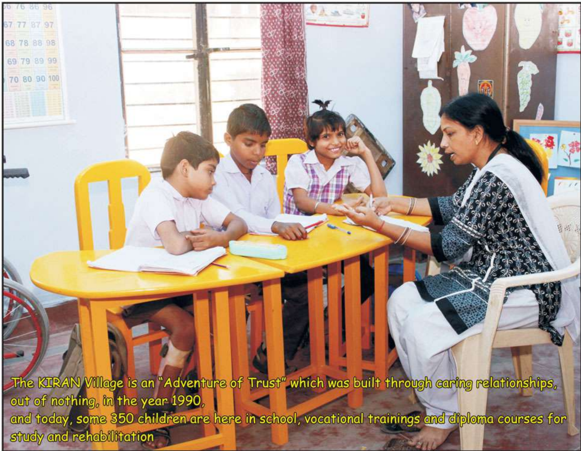
The KIRAN Village is an "Adventure of Trust" which was built through caring relationships, out of nothing, in the year 1990, and today, some 350 children are here in school, vocational trainings and diploma courses for study and rehabilitation