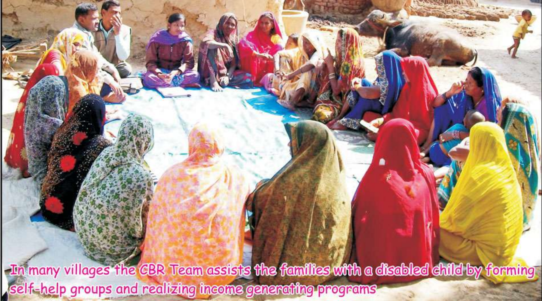
In many villages the CBR Team assists the families with a disabled child by forming self-help groups and realizing income generating programs

किरण सोसाइटी समुदाय आधारित पुनर्वास जागरूकता कार्यक्रम विषय-पुनर्वास (श्रवण बाधित बच्चे) स्थान- चुरावनपुर, मिर्जापुर