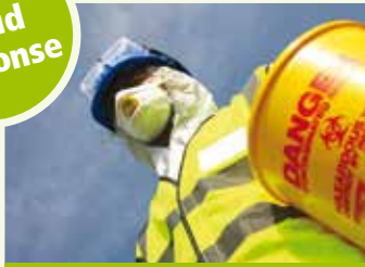
Needles and sharps removal