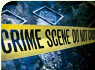
Crime scene clean