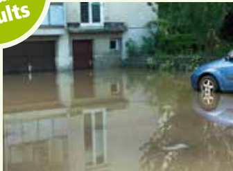
Fire and flood restoration