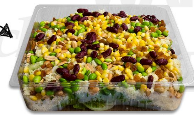
Bean & Nuts Couscous