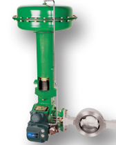
V-Balls, Butterfly, E-Body & HP Control Valves