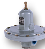
95 & 98 Regulators