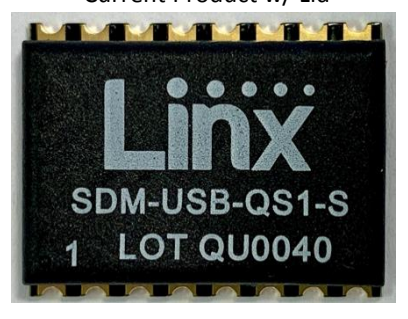
Current Product w/ Lid

The QS module will no longer have a plastic cap covering the module. A reflow compatible label will be used for module identification.