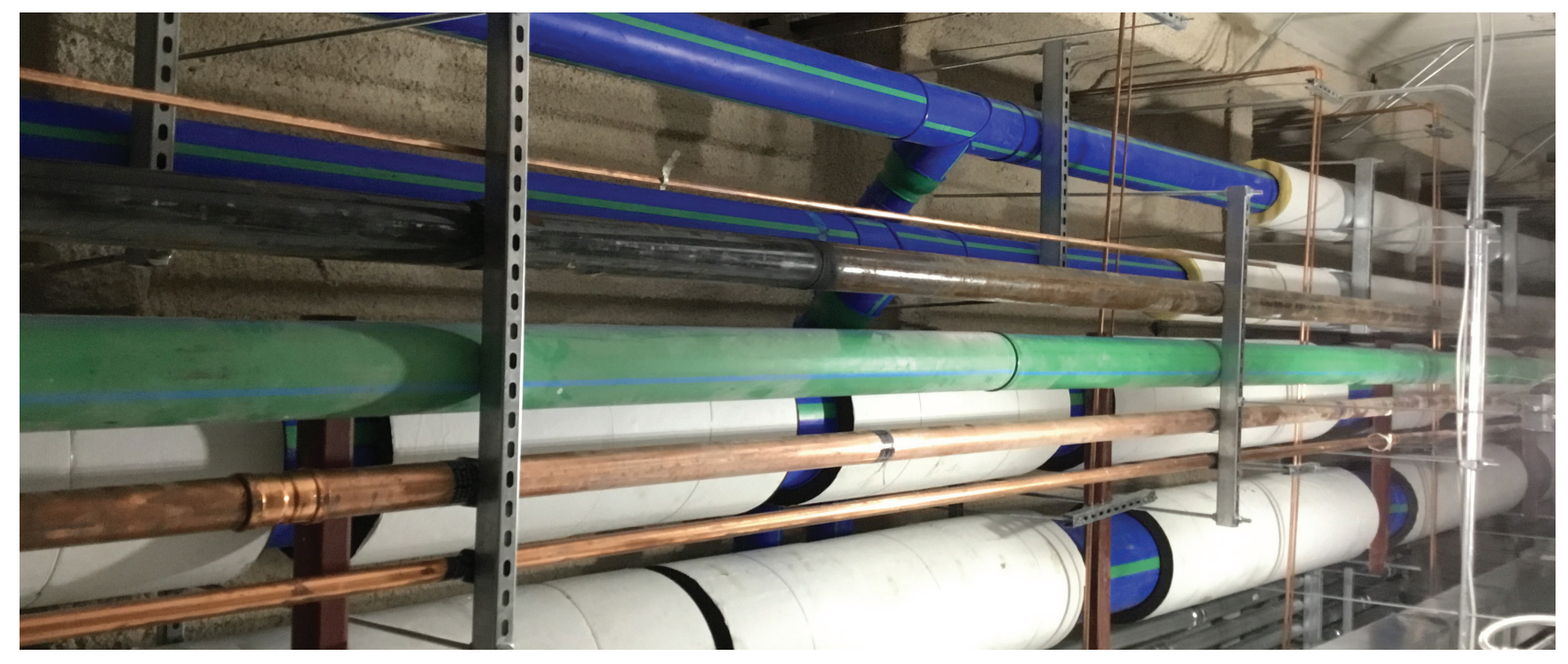
Aquatherm pipe sizes ranging from 3/4-in. to 24-in. installed at the Seminole Hard Rock Hotel & Casino.

strategy similar to carbon steel. Now we're seeing more footage of PP-R pipe going up every day."