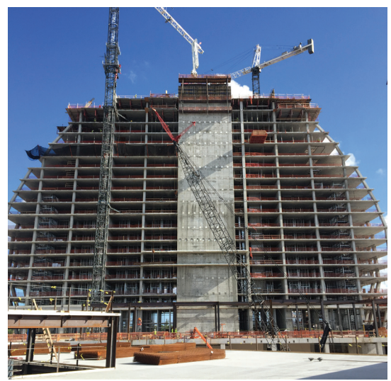
The signature guitar-shaped main building take shape at the Seminole Hard Rock Hotel & Casino in Miami.

Kirlin needed to fabricate and install a piping system to connect a central chiller plant to all of the casino's outlying buildings, including the iconic guitar-shaped hotel and spacious pool area. The company had originally planned to use carbon steel joined with mechanical couplings for the casino expansion and remodel, but when asked to