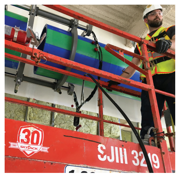
Trying to weld large diameter pipe overhead in tight spaces can be difficult and time-consuming, but the decision to use heat-fused Aquatherm pipe helped keep this project on schedule.

"I know we're getting more proficient with the more time the guys spend working with the product," Norris said. "When we initially started out, we were approaching building