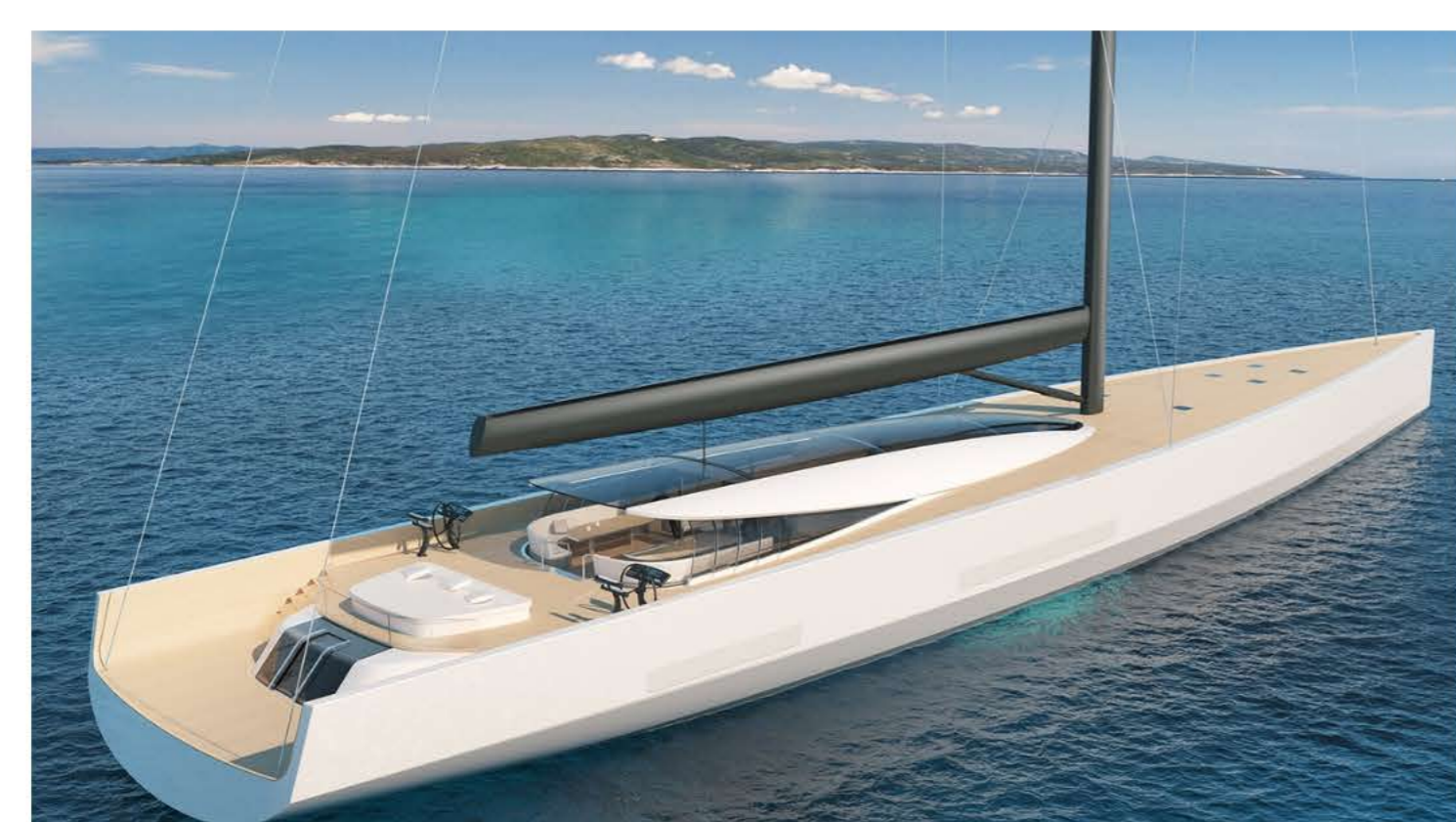
The Perfect 60 is intended for the racing field

However he added that the Perfect 60 would perform on the racing field and "put her owners on podiums wherever they choose to race".