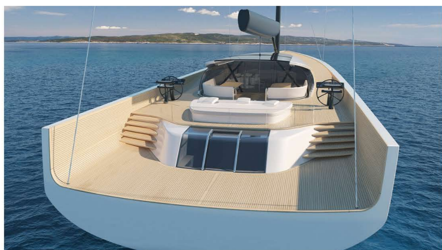
The aft deck of Perfect 60 sailing yacht

The ketch features a carbon fibre mast and rig and same contemporary hull and inverted bow as the SY 300.