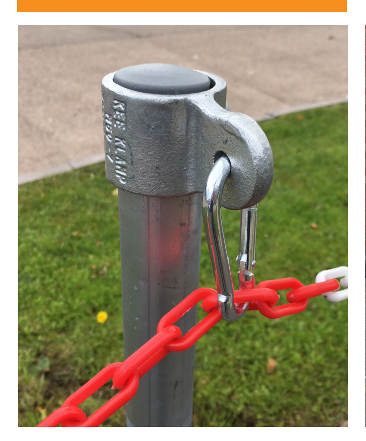
Features of the Kee Mark system

When purchasing KEE MARK from Kee Safety Ltd, you can be assured of unrivalled technical support. Our technical team can offer practical assistance either over the phone or by email.