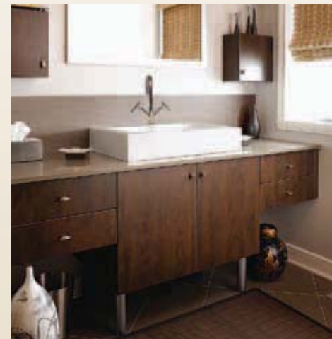
THIS PAGE: STEEL PRESS PLATES ADD TEXTURE AND GLOSS LEVEL THAT ENHANCE THE FIDELITY OF THE DECOR PAPER DESIGN. TFM DECORATIVE PANELS PROVIDE HIGH-END AESTHETICS FOR THE MODERN KITCHEN AND BATH.

or no-added formaldehyde (NAF) products. The CARB emission ceilings are among the most stringent anywhere in the world for composite wood panels, and are complimented by a rigorous third party testing and certification program and extensive chain of custody requirements. Additionally, reclaimed wood sequesters carbon, making composite panels a more ecologically-sound use of fiber than if it's landfilled or burned as biomass.