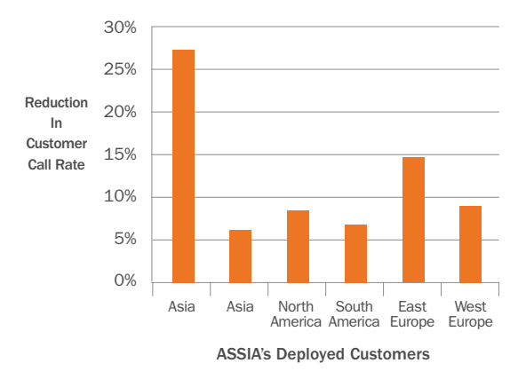
FIGURE 2. ASSIA Customers Show Call Rate Reductions of up to 28%