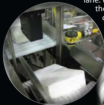
Sorting products from a single lane to multiple lanes for Tub Loading.

Shuttleworth's fully programmable pattern former moves product from one lane to multiple lanes using a pneumatic or electronic mechanism, providing speed and accuracy. This pattern former releases trains of product to designated lanes, ensuring equal number of products per lane. With its lane balancing capability the downstream equipment can continue to run because of the balancing of product flow.