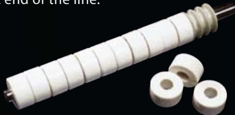
A variety of roller surface materials and 316 stainless steel construction is available