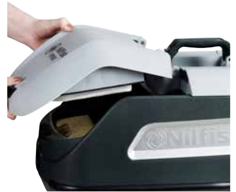
Magnetic hinges ensure high reliability