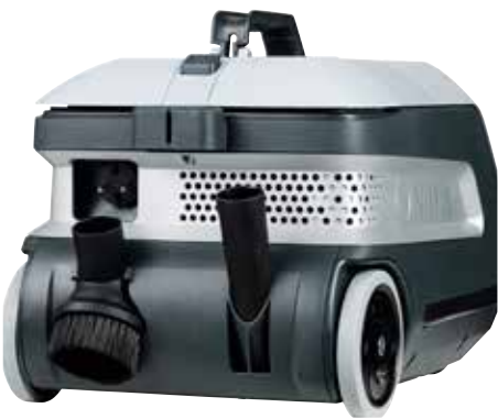
User friendly and easy to reach accessories