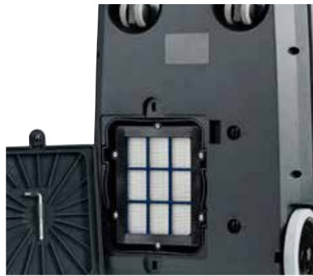
HEPA H13 exhaust filter is standard on all VP600 models