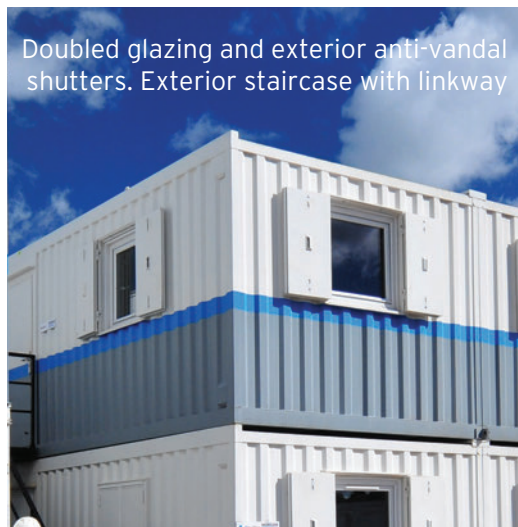
Doubled glazing and exterior anti-vandal shutters. Exterior staircase with linkway