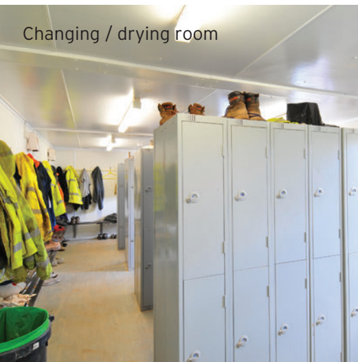
Changing / drying room