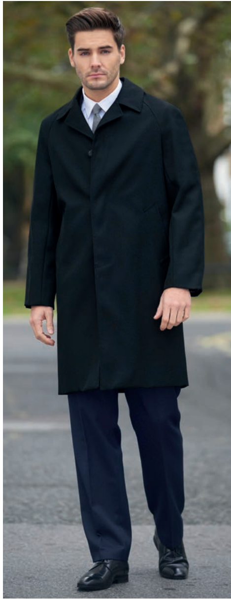
WHIPCORD Men's Raincoat Black

Codes & Colours: 9760A Charcoal 9760B Navy 9760C Black