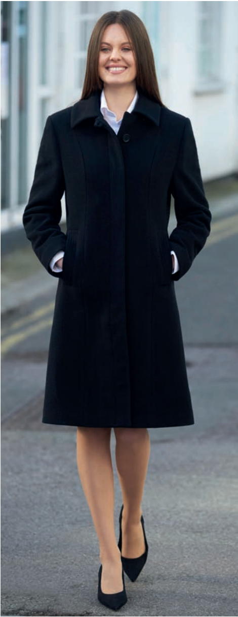
BURLINGTON Women's Overcoat Black

Single breasted, 7 button, fly front, centre vent, rear belt detail