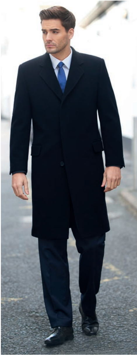
BOND Men's Overcoat Black

Single breasted, 3 button, fly front, centre vent, hand edge stitching