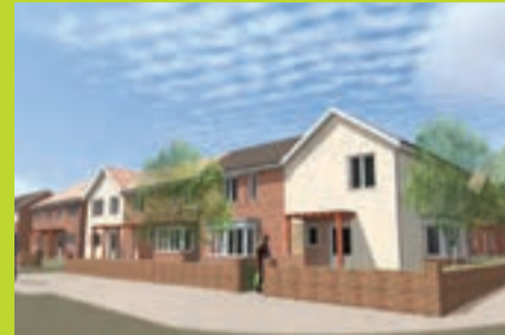
39 properties for Birmingham City Council are being built to the north of the Dove Medical Centre and are due to be completed by February 2015.