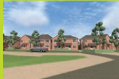
20 new WLCA properties are also being built on the site bordering Dovedale, Capilano and Wendover Roads. These homes are due to be completed by Christmas.

Work is now well under-way on this large and exciting development.