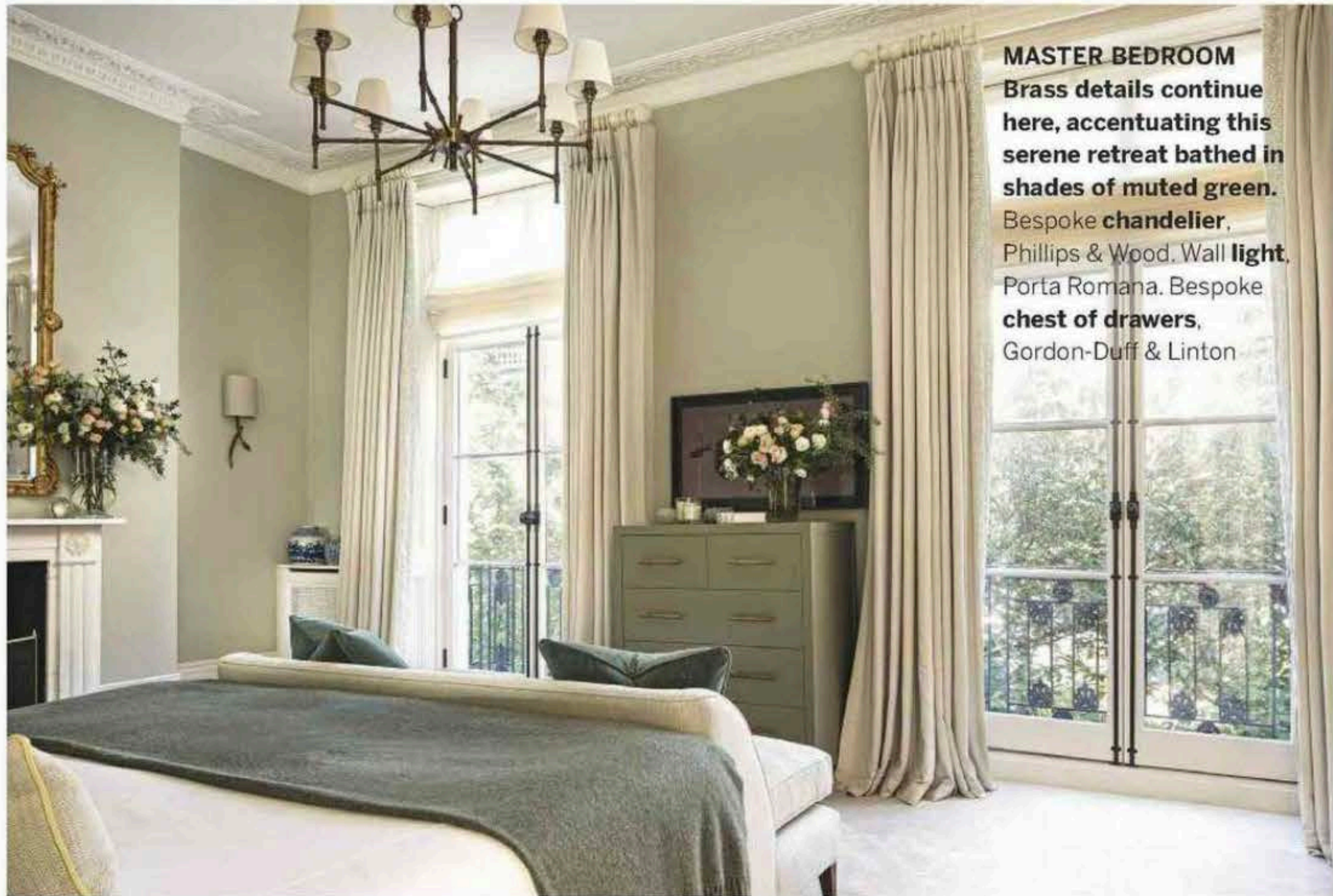
MASTER BEDROOM Brass details continue here, accentuating this serene retreat bathed in shades of muted green. Bespoke chandelier, Phillips & Wood. Wall light, Porta Romana. Bespoke chest of drawers, Gordon-Duff & Linton