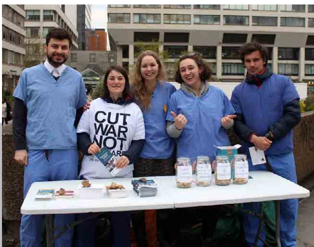
Medact campaigning for health.

The Medact Arms and Militarisation Group has been campaigning against UK arms sales to Saudi Arabia, and running campaigning and educational events about the arms trade and the bombing of hospitals in war zones.