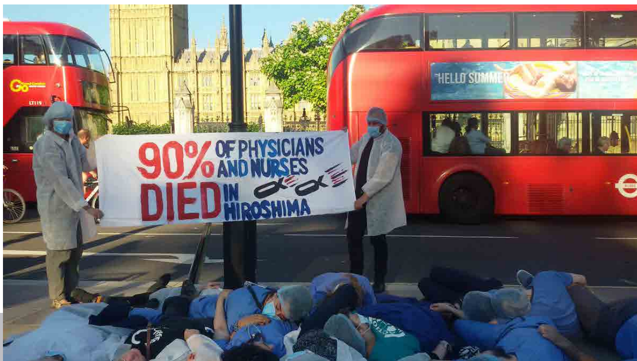
Medact campaigning against renewal of Trident outside Parliament.

Medact members raised anti-nuclear weapons issues at the BMA Annual Representatives' Meeting for 2016, and also participated in the large anti-Trident demonstration that took place in February this year, along with multiple other peace, environmental and human rights demonstrations around the UK.