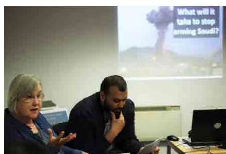
Medact discussion on how to campaign against the sale of arms to Saudi Arabia

Medact Oxford will launch officially in the autumn of 2016 and will be developing campaigns supporting Medact's work on Climate and Ecology as well as other programme areas.