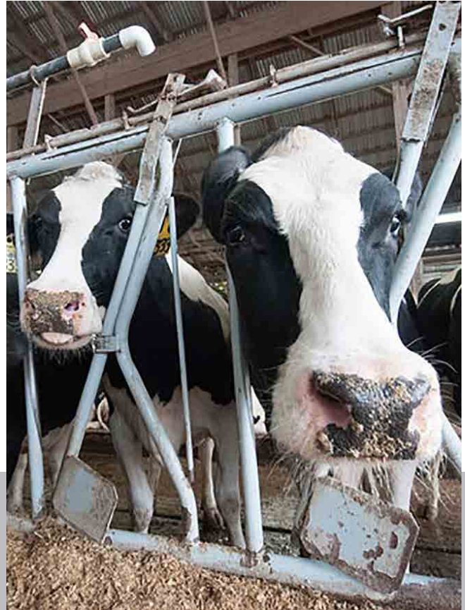
A more sustainable diet means less meat consumption.

Although the government's new Eatwell Guide (published in March 2016) mentions sustainability and places more emphasis on plant based foods, there is still room for improvement and a need to make the links between our diets, the environment and health explicit.