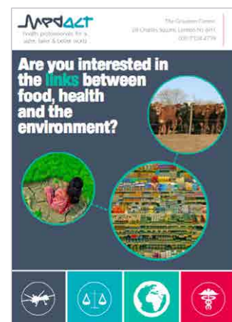
Medact engaging on the links between food and health.

In the same way that we have catalysed the development of groups of health professionals with an interest in tackling the harmful effects of militarisation and unethical arms trading, we have started to catalyse the establishment of local groups of health professionals who will form to campaign and lobby for healthy changes to the food system. This includes encouraging local groups to campaign to ensure that NHS hospitals provide healthy, nourishing and sustainable food for their patients and staff.