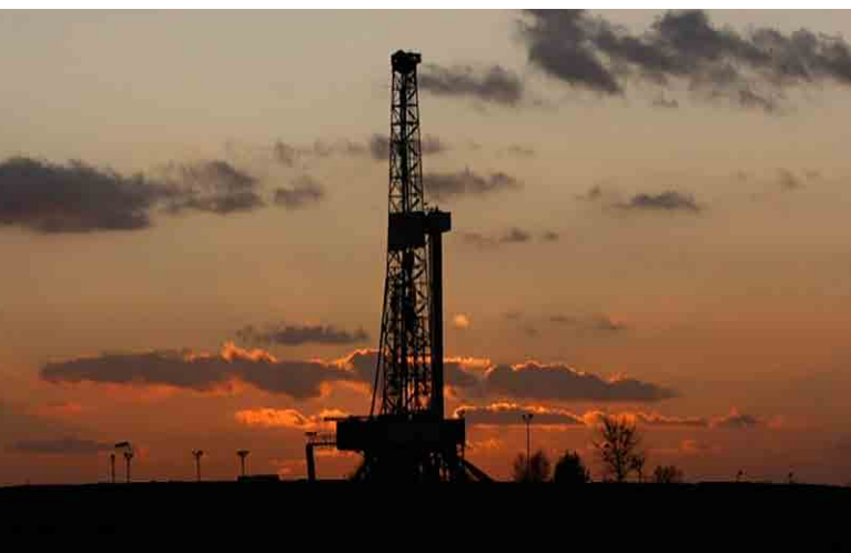
Medact has highlighted the potential health risks of fracking.

In November 2002, Medact produced a health impact assessment that concluded that launching a war on Iraq would be catastrophic and counter-productive. In noting Medact's study, the Chilcot Report clearly nodded to the importance of comprehensive and thoughtful analysis before rushing to war, while acknowledging the validity of health professionals engaging robustly in matters of peace and international affairs. Fourteen years on, this report is still worth reading.