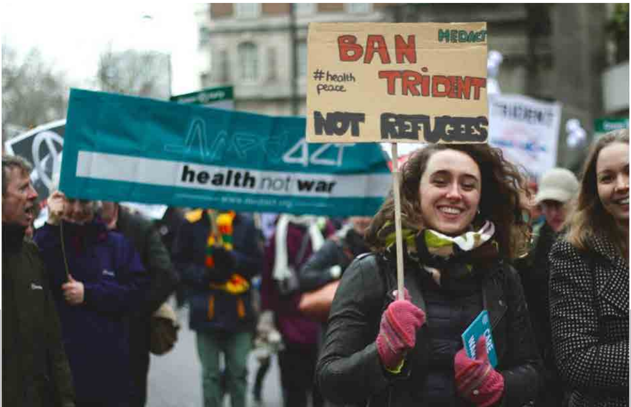
Medact campaigners at Stop Trident march.

We have also, with much less success, been campaigning against the folly of replacing Trident in the UK; and drawing public attention to the risks associated with the transportation of nuclear warheads near and through UK cities and towns.