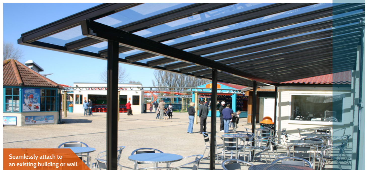
Seamlessly attach to an existing building or wall.