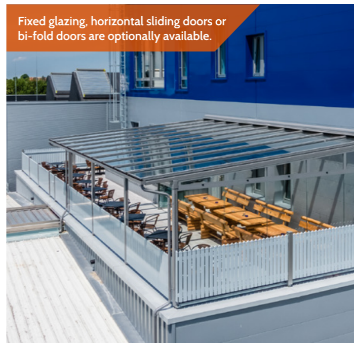
Fixed glazing, horizontal sliding doors or bi-fold doors are optionally available.