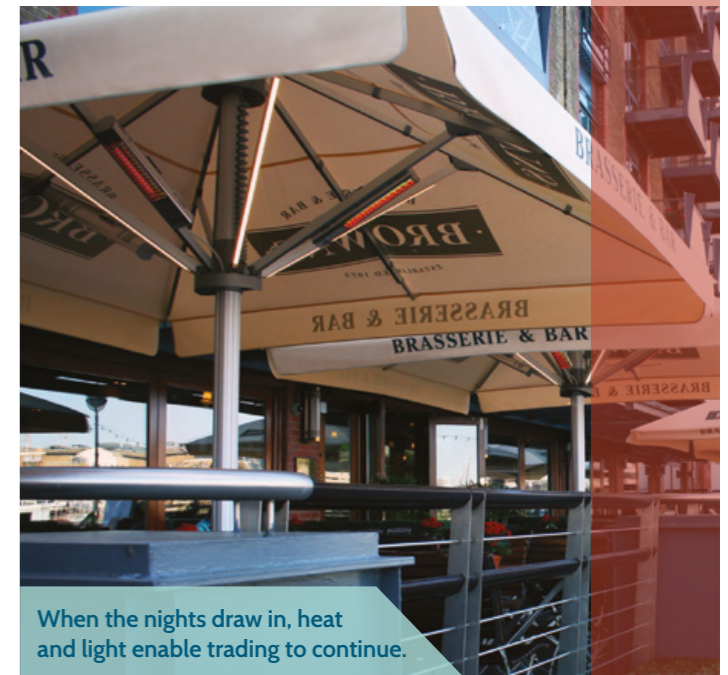
When the nights draw in, heat and light enable trading to continue.