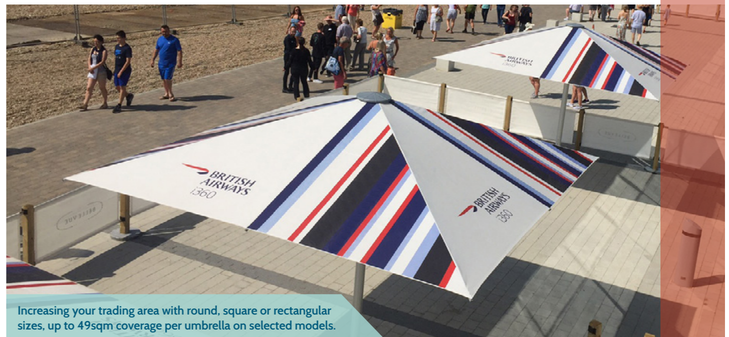
Increasing your trading area with round, square or rectangular sizes, up to 49sqm coverage per umbrella on selected models.