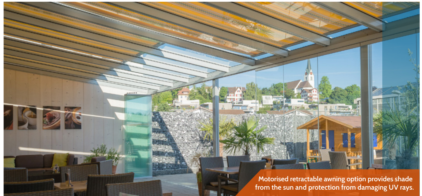
Motorised retractable awning option provides shade from the sun and protection from damaging UV rays.

The glass roof system is a unique choice for alfresco dining. Its fixed glazed roof lets in maximum light and provides shelter from the elements, and when combined with the option of a retractable awning can provide shade from the sun.