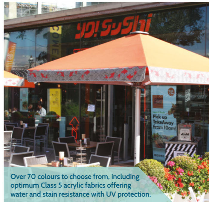
Over 70 colours to choose from, including optimum Class 5 acrylic fabrics offering water and stain resistance with UV protection.