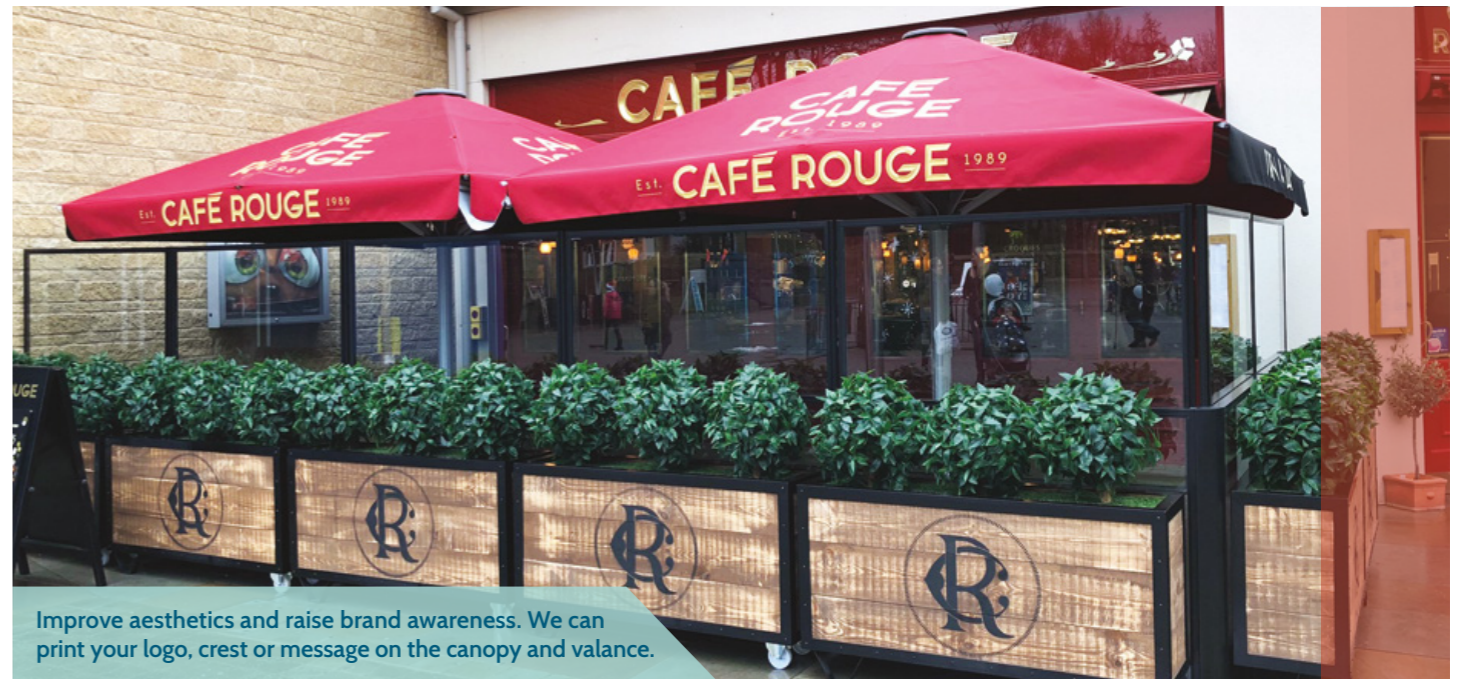
Improve aesthetics and raise brand awareness. We can print your logo, crest or message on the canopy and valance.

AEL offer a wide variety of giant umbrellas that cover up to 49sqm. They provide comfortable and stylish shelter for customers, together with heating and lighting options, making your brand stand out with numerous printing and colour options.