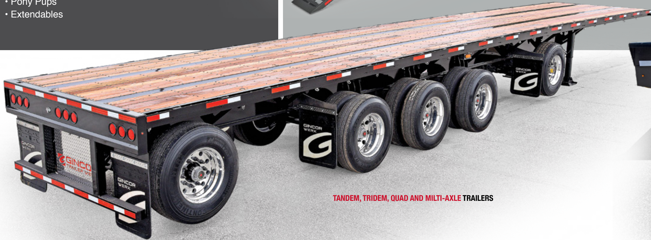
TANDEM, TRIDEM, QUAD AND MULTI-AXLE TRAILERS