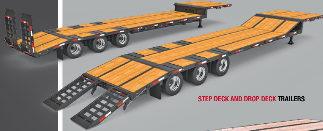
STEP DECK AND DROP DECK TRAILERS