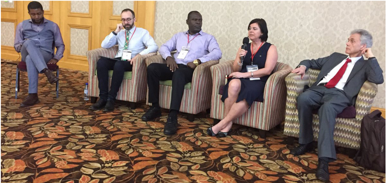
Part of the KE Training team Recirculate Knowledge Exchange and Engagement in Malawi