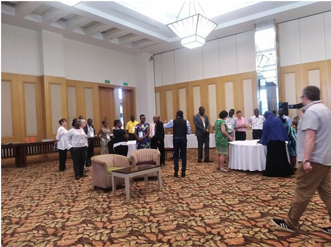
Delegates taking part in group activities