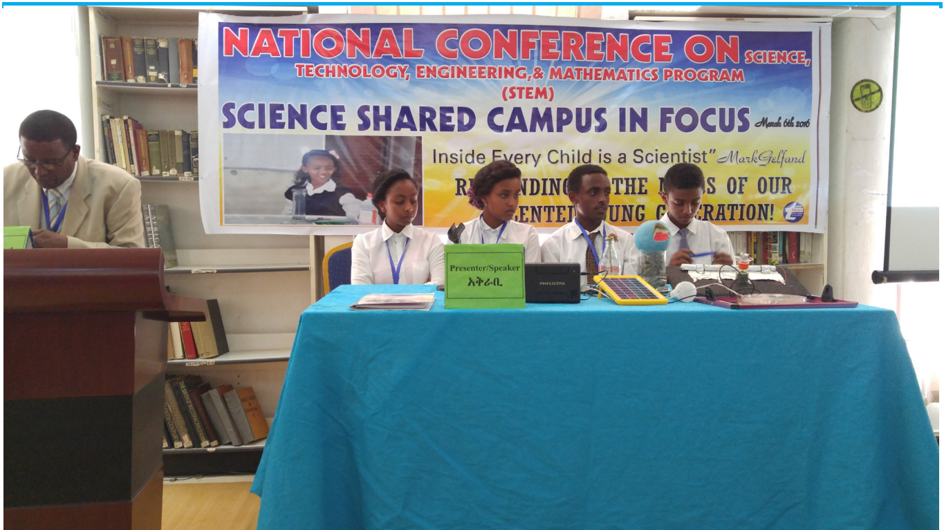
9th Grade students of Kotebe Shared Science Campus students, panel discussion of National Conference on STEM in High Schools, 2016

problem forcing teachers to rely on theoretical explanations rather than practical applications and teacher-centered content delivery. In Ethiopia “STEM Synergy”, a non-profit organization has introduced many STEM initiatives in the country. One of the programs managed by STEM Synergy in the country is science shared campus. Science shared campus addresses many of the widespread challenges in the take up and attainment of STEM subjects at secondary school level. The program is designed to build students’ knowledge of the inter-related nature of science and mathematics, in order to allow them to develop their understanding of engineering and technology.