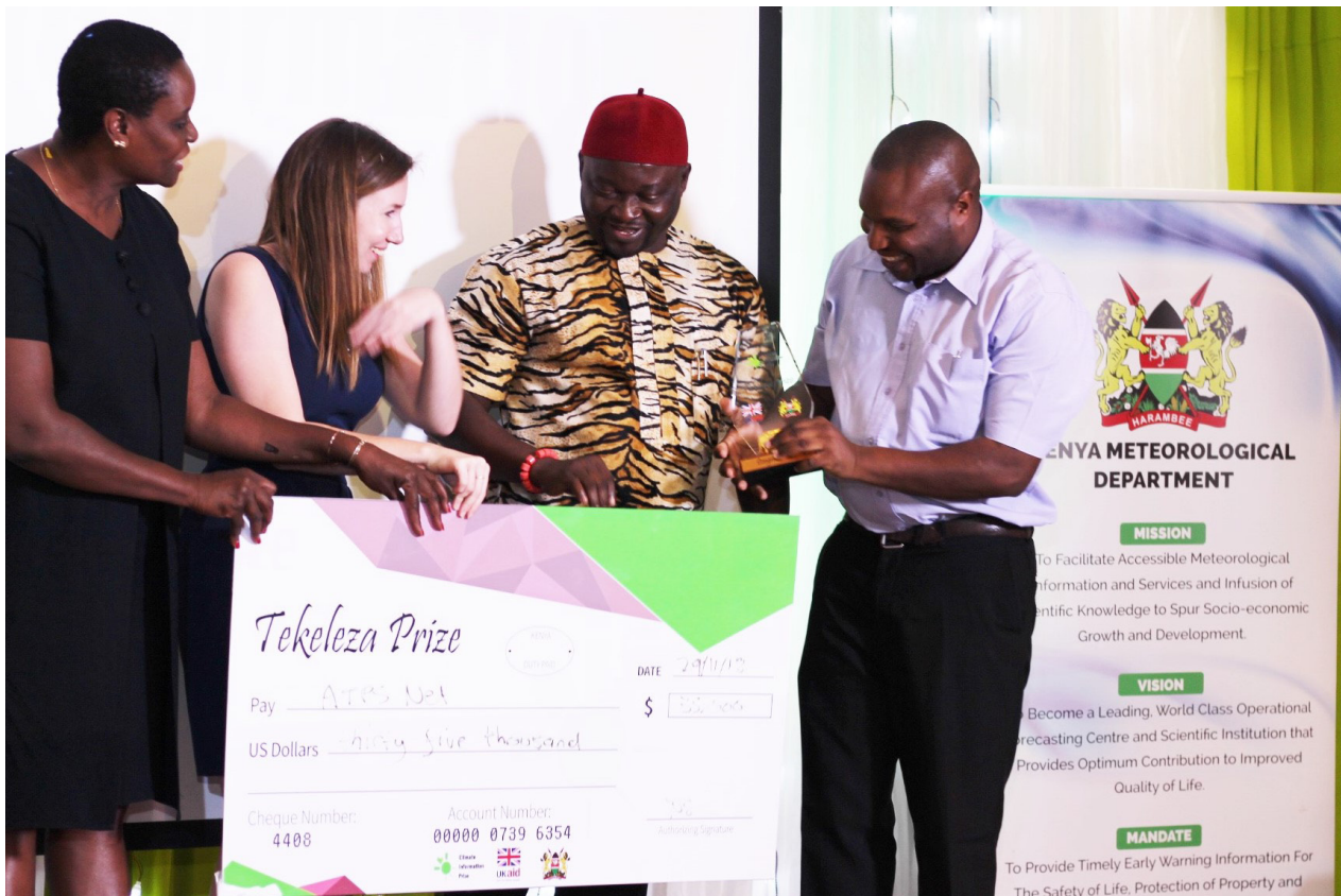
ATPS officials receiving the Tekeleza Prize award in Nairobi