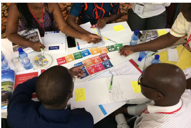
Group Discussions during one of the sessions