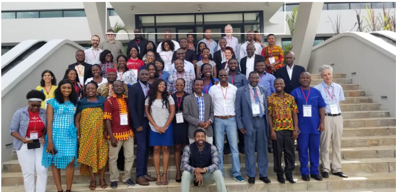
Delegates present at the Recirculate Entrepreneurship and Innovation Workshop in Kitwe, Zambia