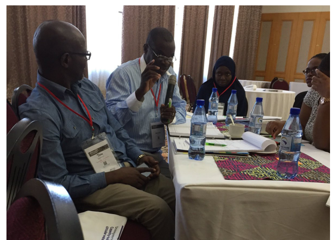
Group Presentation of KE Mechanisms