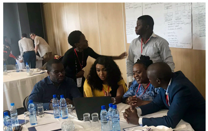
Delegates taking part in group discussions