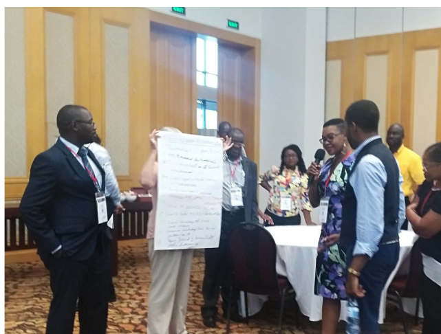
Group Presentation of KE Mechanisms