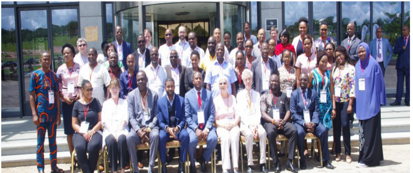
Delegates present at the Recirculate Knowledge Exchange and Engagement in Malawi