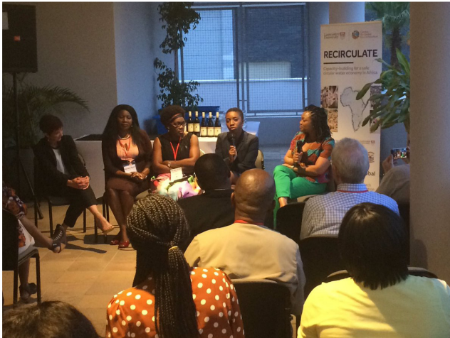
Delegates at the launch of Women Innovators Network for Africa (WINA)