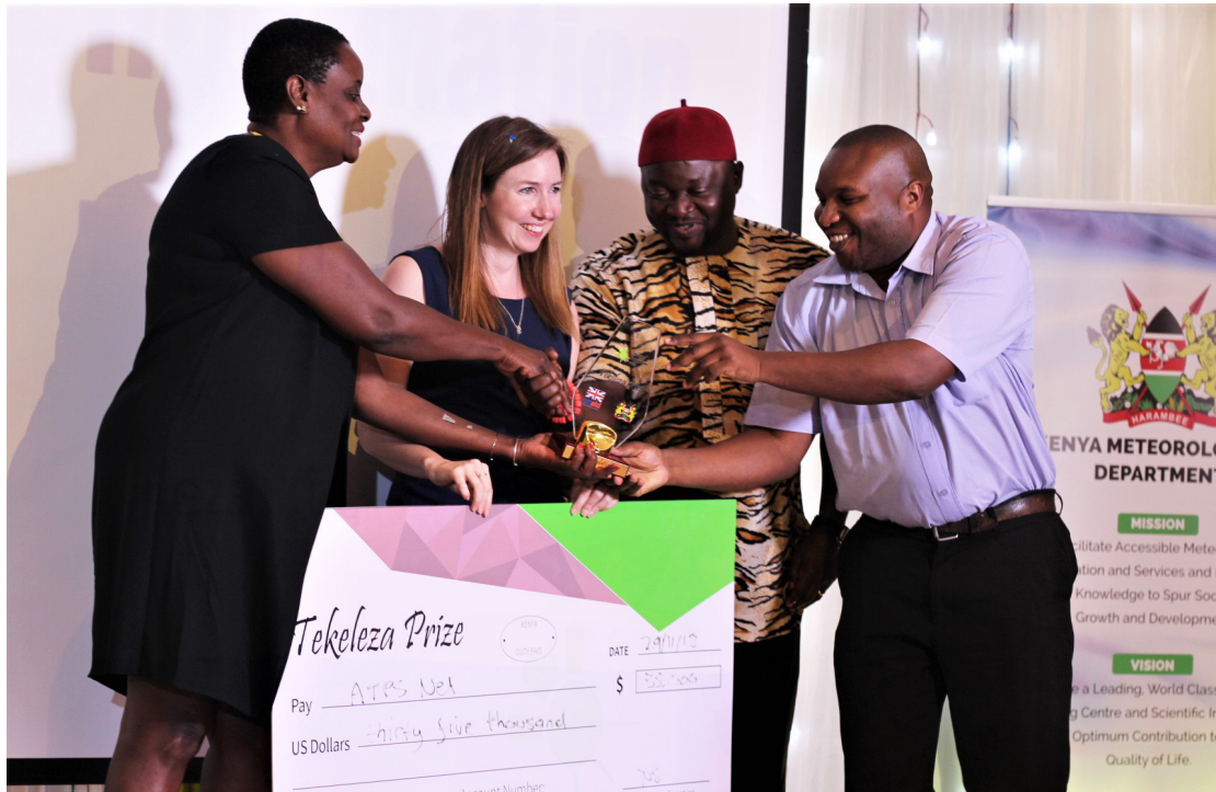
ATPS Management receiving the Tekeleza Prize Cheque