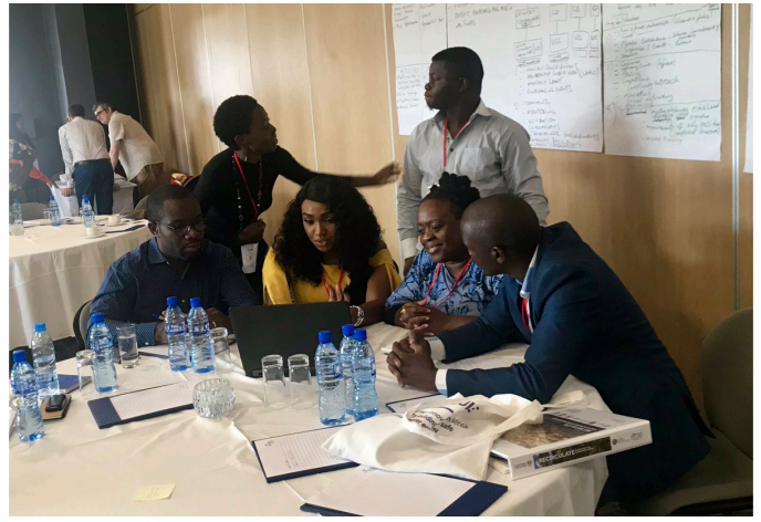
Delegates participating in a group discussion