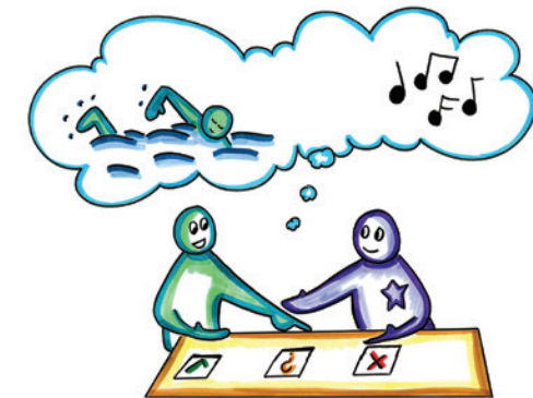
Service design and delivery