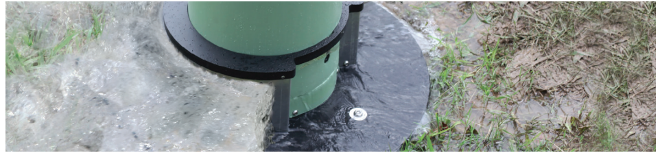
HG-8 Cold Climate Flushing System