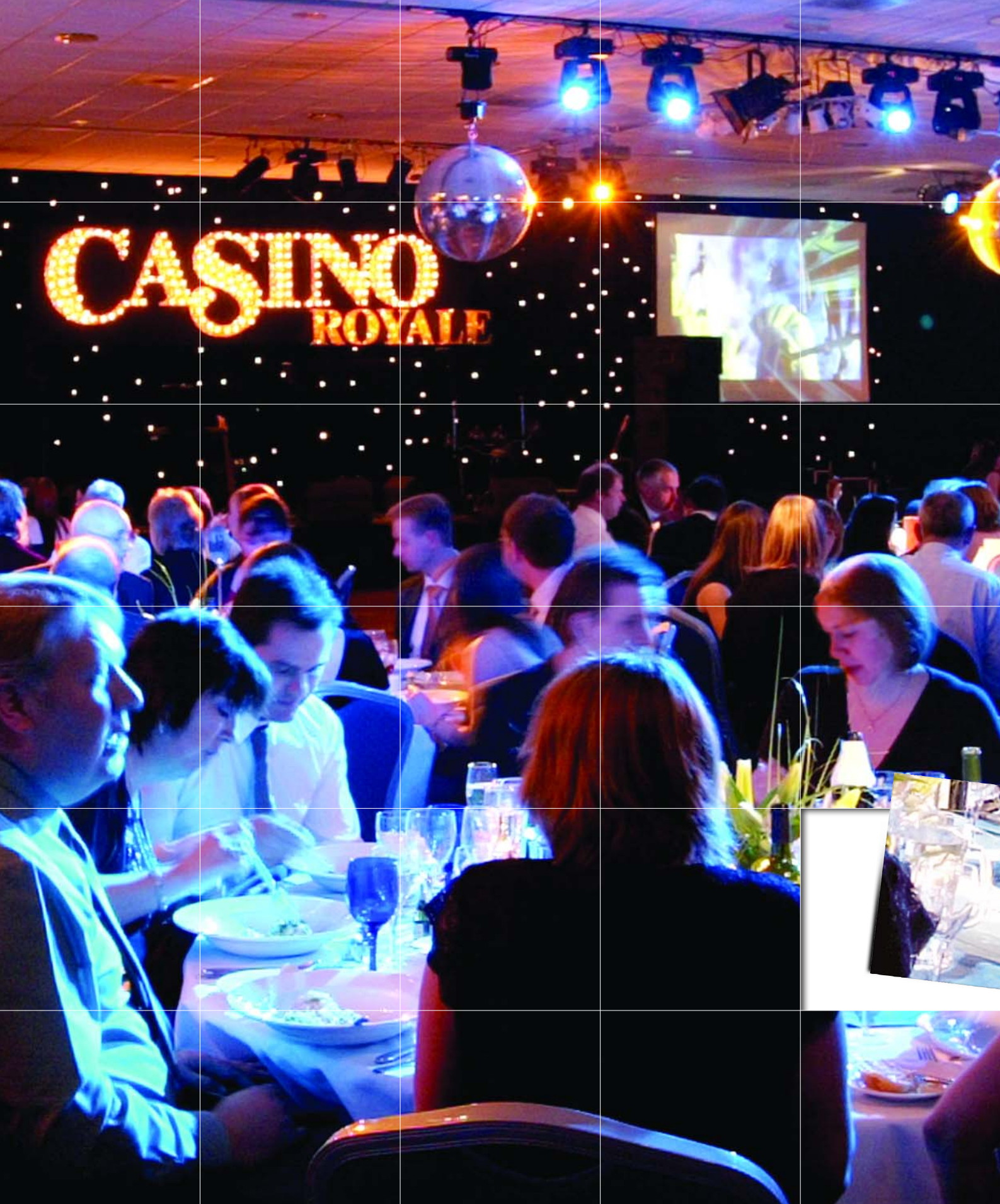
Boots Healthcare International's motivational event based on a James Bond theme