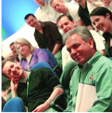
...ENGAGING THE AUDIENCE

When we work with you, our team is as big as it needs it to be. Unique Solutions' account managers, event designers and venue researchers are instrumental in interpreting your business needs, while our event managers select and coordinate set designers, coaches, audio visual teams, facilitators and many other specialist providers. Together, we build experiences that work brilliantly for the attendees - and for you.