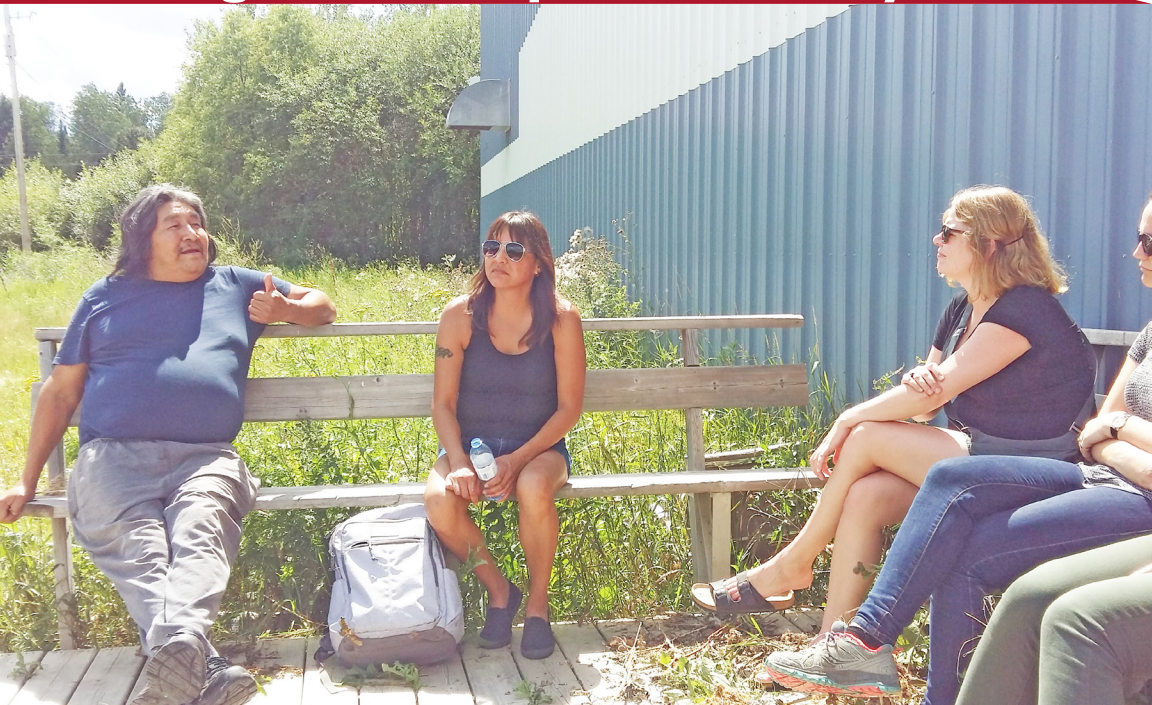
Members of Shoal Lake 40 tell IPS delegates about life on the reserve.