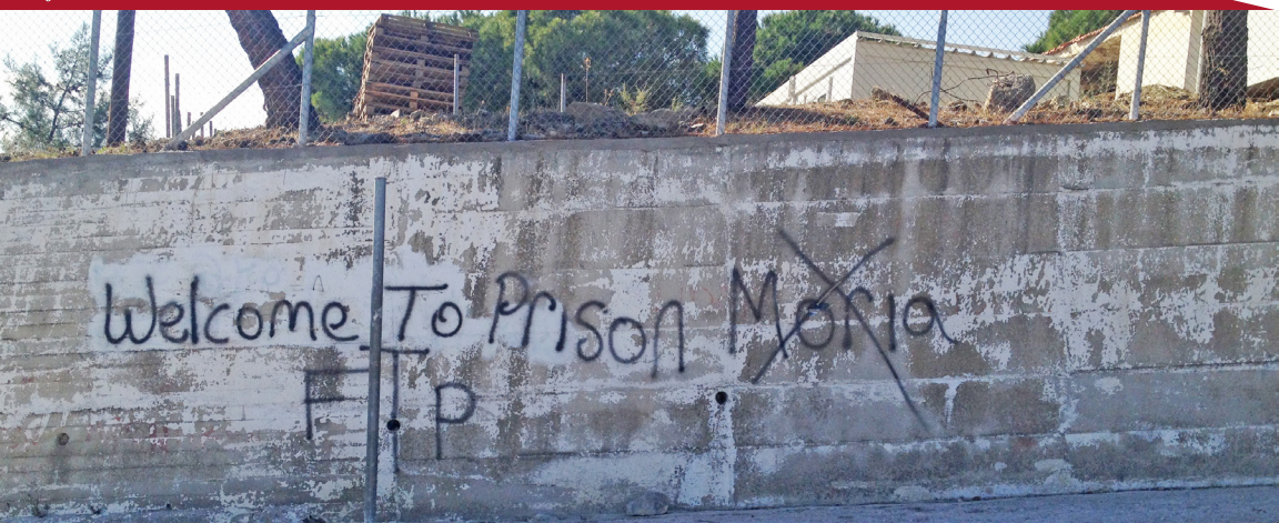
Anti-Moria graffiti made by migrants.