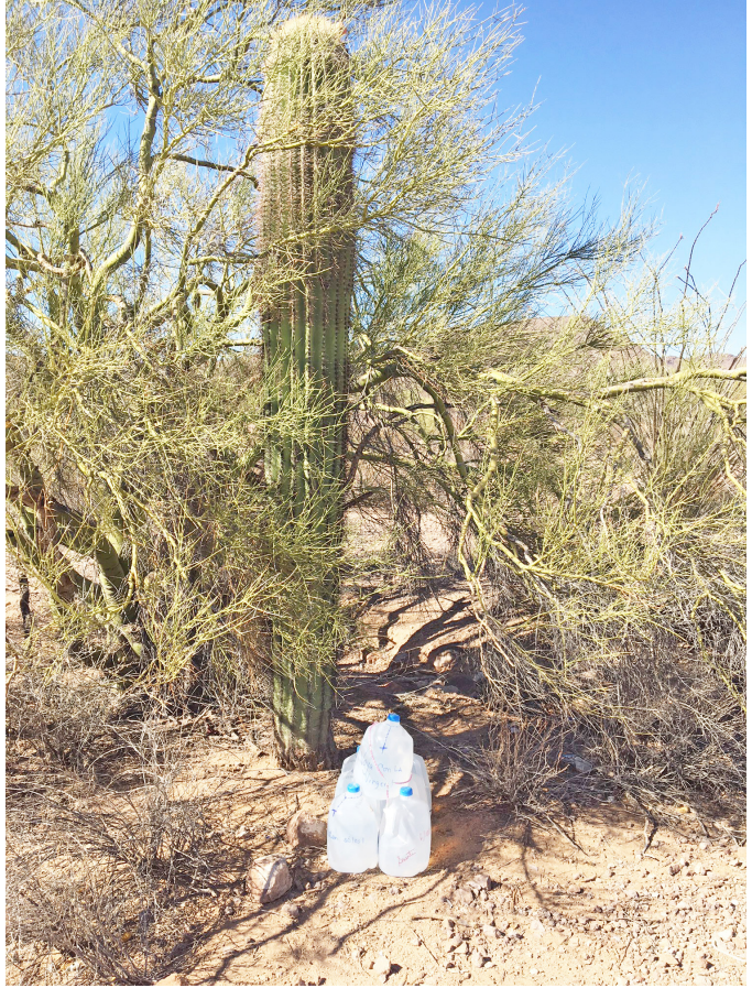
Water left on a migrant trail on the US/Mexico border, wrapped in a rosary.

In May, residents of Ajo initiated a monthly vigil in the town’s central plaza to commemorate the lives of those who have died in and near their community. Most of the deceased are unidentified. Their names may