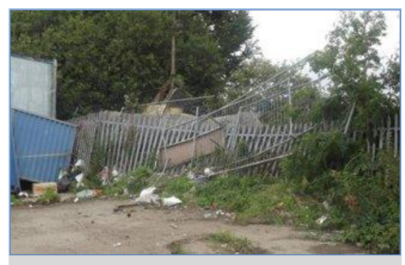
The entrance to the footpath from Water Row at the vehicle ferry was closed off in the late 1980s ending nearly 180 years of access to the footpath.

Now 100 years after the abolition of almost all of the riverside right-of-way it is great news that the part west of Water Row that was not abolished in 1914 will be refurbished to be once again enjoyed by Govanites and Glaswegians; however, a much needed bridge linking the Riverside Museum to the new Govan Riverside Walkway and The Govan Stones would no doubt bring the greatest benefit to Govan.