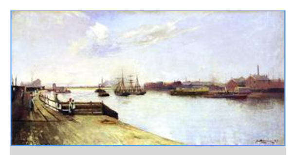
This 1887 painting by John MacNiven shows the wooden walkway looking westward from around Water Row towards the Old Silk Mill and Fairfield and was the only part of the right-of-way not abolished in 1914.