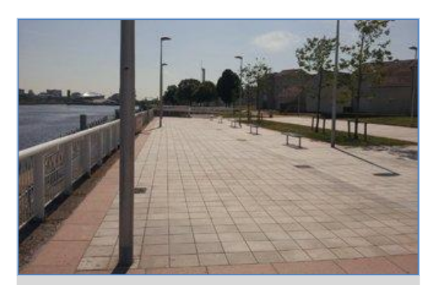
Other parts of the river bank have been reclaimed for public riverside walkways including Harland Way above.