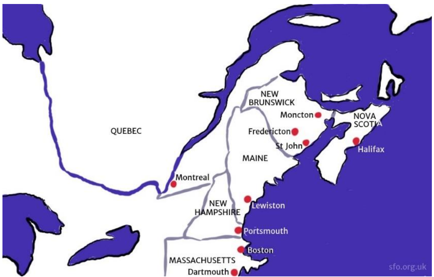
Sketch map of part of the North-Eastern seaboard of the USA and Canada showing places likely to feature in the SFO's 2020 Tour

We'll visit two great countries, each with strong links to Scotland and the UK – you only have to look at the place names to see that.