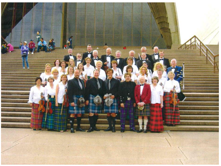
SFO members outside Sydney Opera House, 2004

Auld Lang Syne was finally played and the emotion felt by both the orchestra and audience was overpowering as the last note died away.