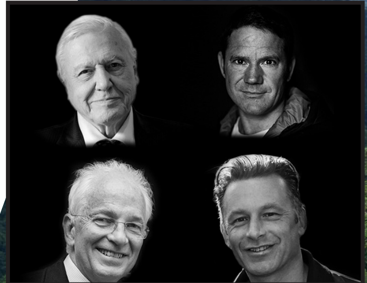
World Land Trust Patrons: Sir David Attenborough, Steve Backshall, David Gower, Chris Packham