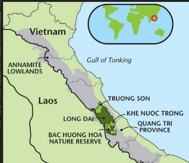
Map showing Khe Nuoc Trong